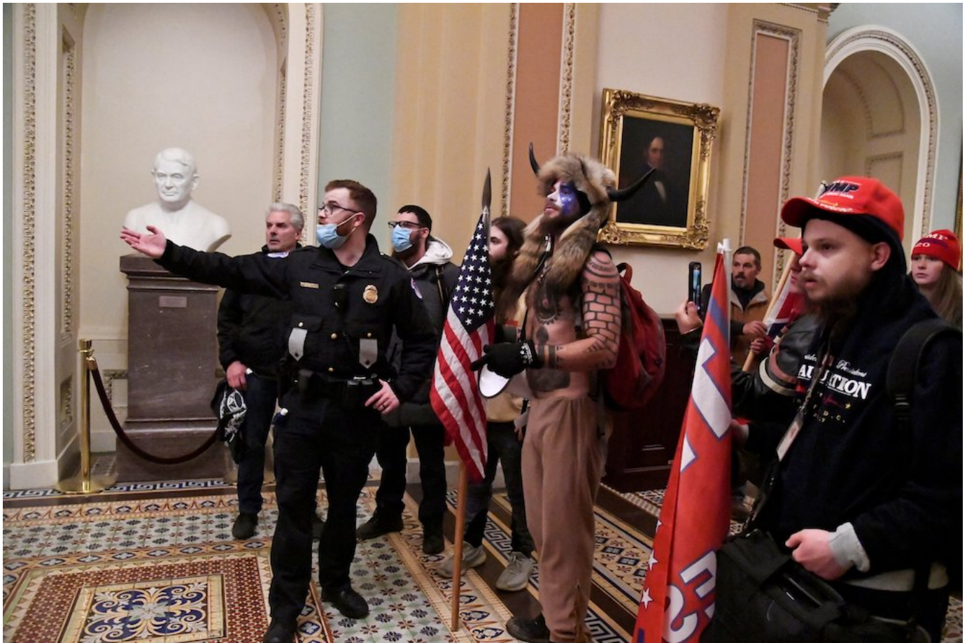
A police officer speaks to supporters of President Donald Trump who got inside the U.S. Capitol Jan. 6, 2021.

Delusional cult leaders create delusional followers. In the televised scenes of the Jan. 6 attempted coup at the U.S. Capitol, we saw alarming images of this "collective delusion" in our national psyche. Scattered among the confederate flags, MAGA caps, neo-Nazi insignias and a "Camp Auschwitz" T-shirt, there were also signs declaring that "Jesus Saves."