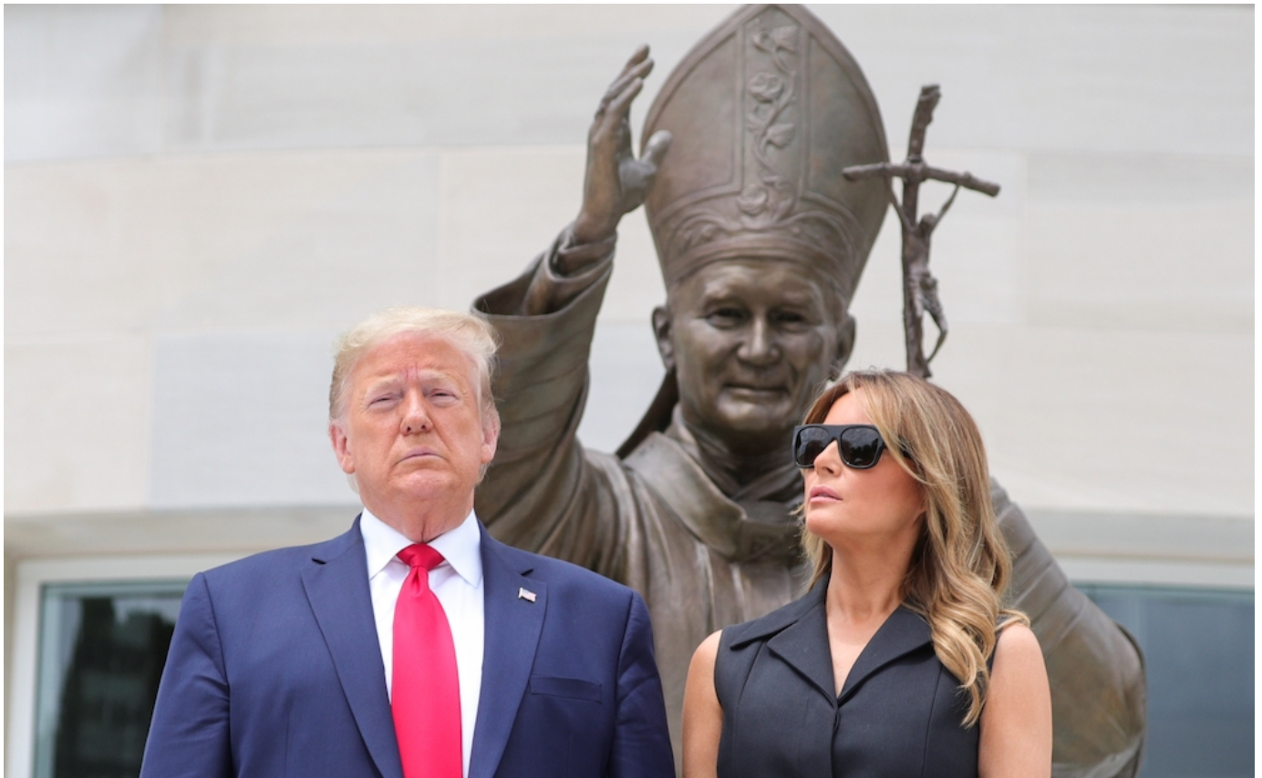
U.S. President Donald Trump and first lady Melania Trump pose outside the St. John Paul II National Shrine in Washington June 2, 2020, the 41st anniversary of beginning of pope's 1979 historic visit to Poland.

The clues were emblazoned on the red hats and in the chants at every rally: Make America Great Again! Fake news! Lock her up! You're fired! Drain the swamp! Build a wall! These slogans had the power to whip the crowd into a frenzy, giving Trump a fresh source of energy — or as psychologists would say, "narcissistic supplies."