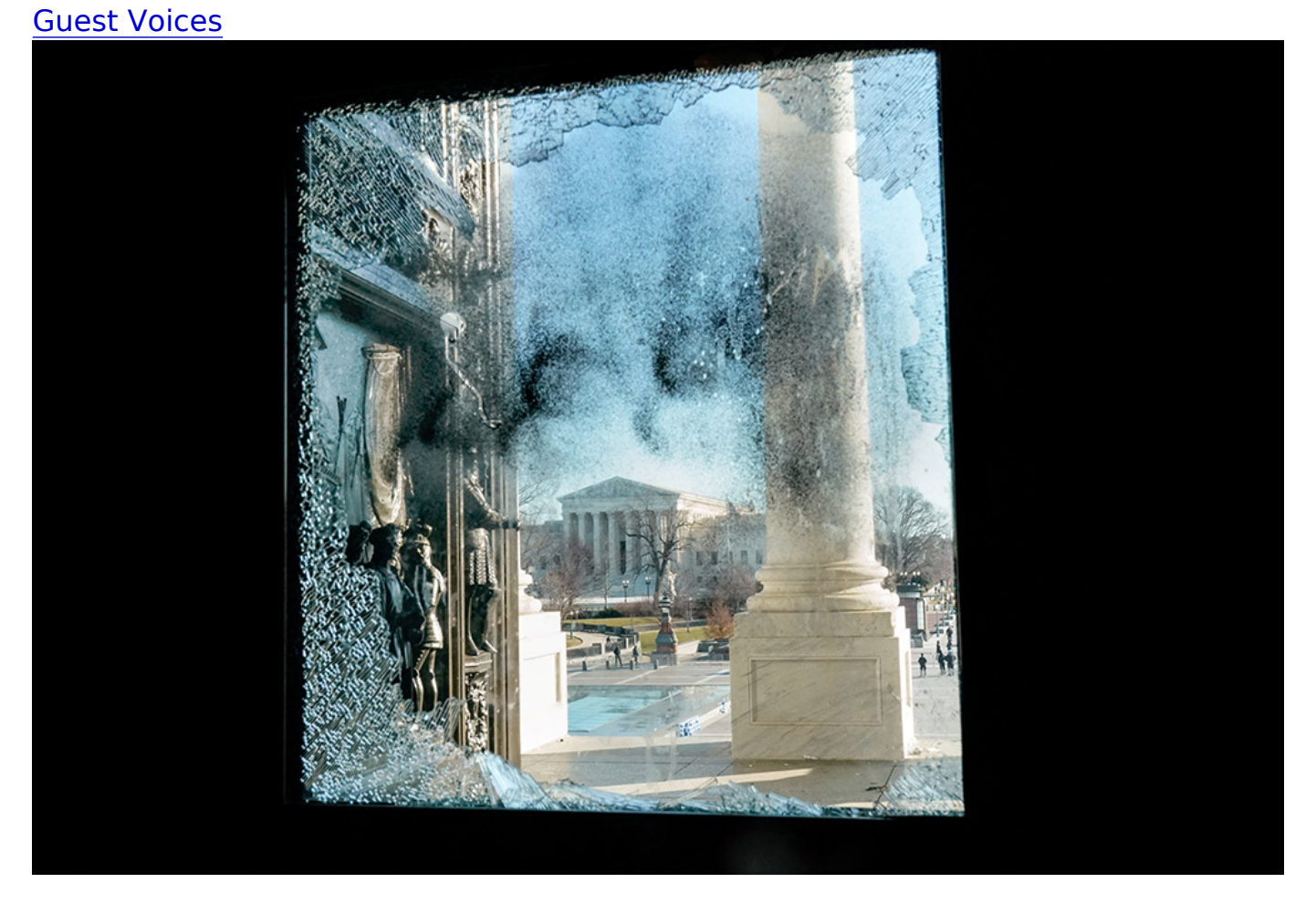
The U.S. Supreme Court is seen through a smashed glass door at the U.S. Capitol in Washington Jan. 7, one day after supporters of President Donald Trump stormed Capitol Hill.