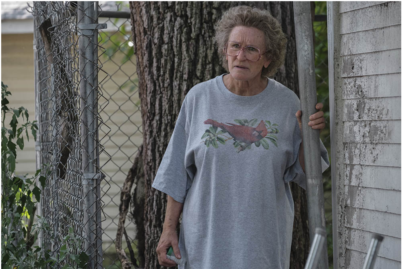
Glenn Close plays Mamaw in a still from "Hillbilly Elogy."

One reviewer criticized Amy Adams for her portrayal of Bev as a waste of her talent, but if you have ever lived with a family member who is dependent on alcohol or drugs or both, I think she's turned in an award-winning performance (as does Close.) You can really feel how the child-parent bond is destabilized and strained to the breaking point due to addiction. You can also rejoice in the incredible influence and love of a grandmother who will sacrifice her sustenance level resources to give a child a stable home. Other critics say the film reinforces poor southern white stereotypes, yet if these were J.D.'s experiences, he gets to witness to that reality, to tell that story.