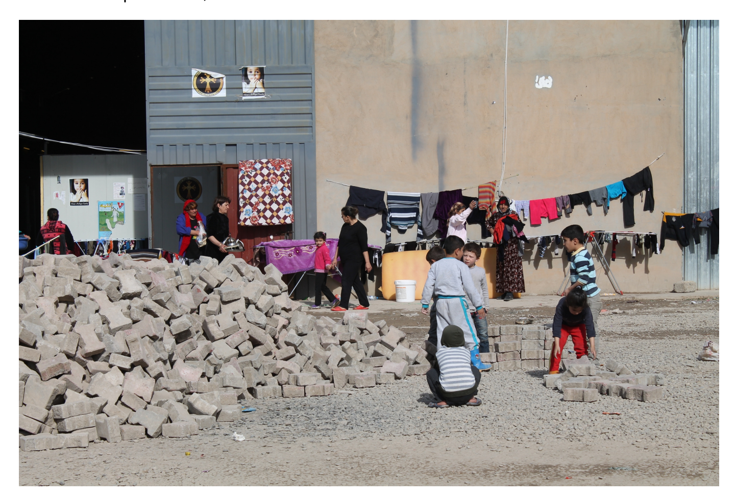
Iraqi Christian children play with concrete blocks Jan. 21, 2015, in a camp, new at the time, set up for the displaced on the outskirts of Ainkawa, Iraq.

While serving in Iraq, she and her team were told not to stop for civilians on the roads even if they were children. This might entail running over an Iraqi child in order to keep the convoy of U.S. soldiers moving to avoid being ambushed by enemy soldiers, but that was her job. After all, she was a soldier and had pledged her allegiance to a nation she had sworn to protect and defend. If this meant killing innocent Iraqi civilians, so be it.