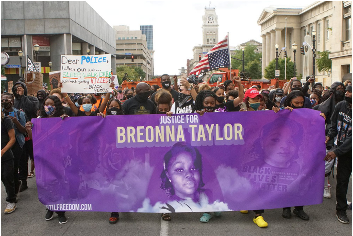
Demonstrators in Louisville, Kentucky, march for Breonna Taylor Sept. 25.