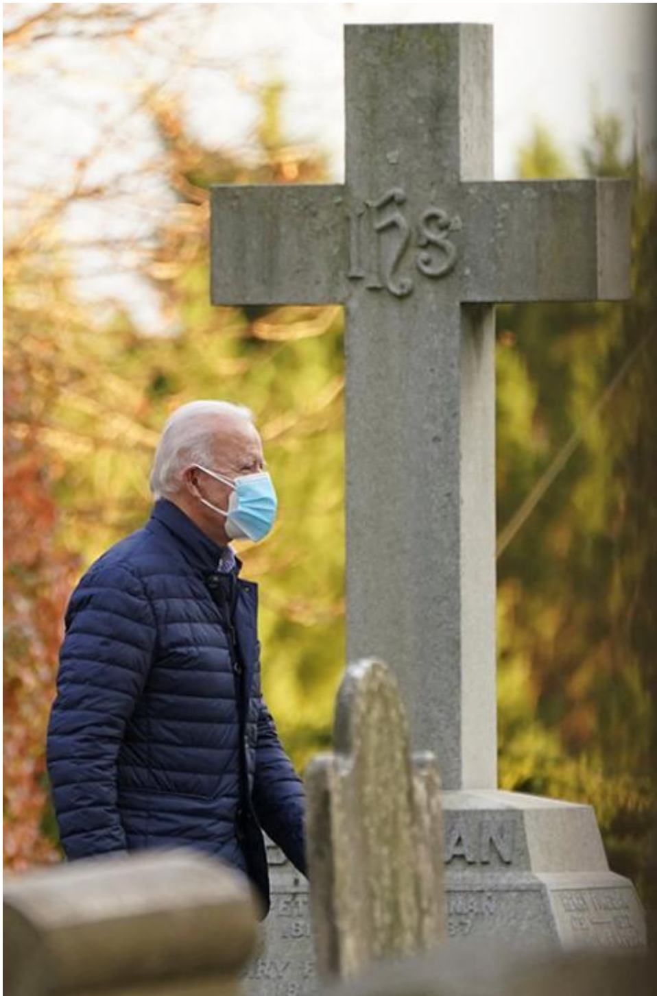
President-elect Joe Biden arrives to attend Mass in Wilmington, Delaware, Dec. 5.

Biden's faith clearly has had an impact on his greatest political gift, that of public empathy, weaving his own struggles of the deaths of his children and first wife with the stories of public loss from pandemic or violent mass killings. It is no small thing. Think of what we haven't had for the past four years. We will now have a gifted