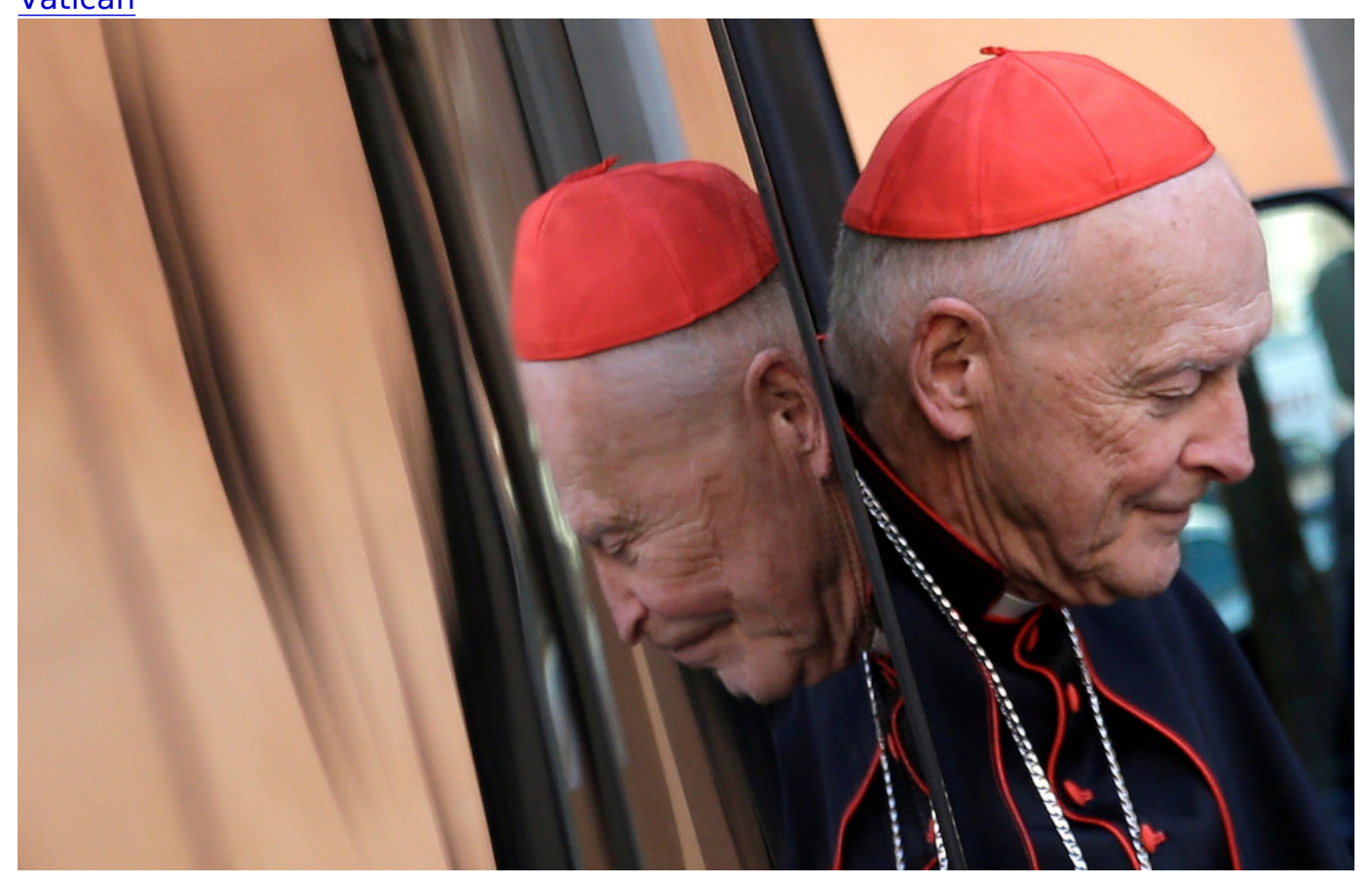
Then-Cardinal Theodore E. McCarrick is seen at the Vatican March 4, 2013.