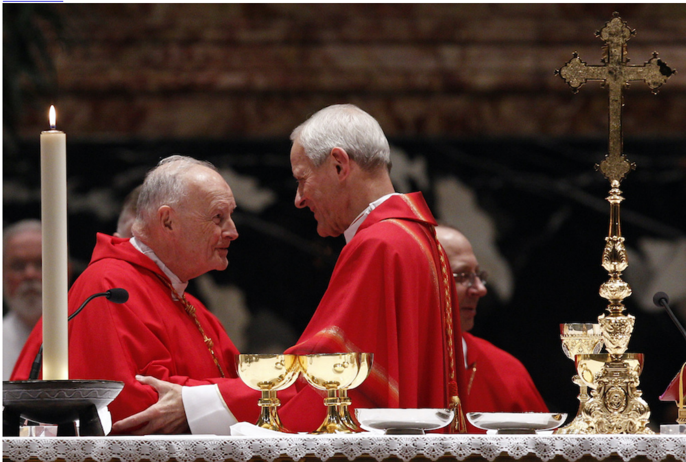
Cardinal Donald Wuerl of Washington, D.C., right, greets then-Cardinal Theodore McCarrick, retired archbishop of Washington, during the sign of peace at a Mass of thanksgiving in St. Peter's Basilica at the Vatican Nov. 22, 2010.