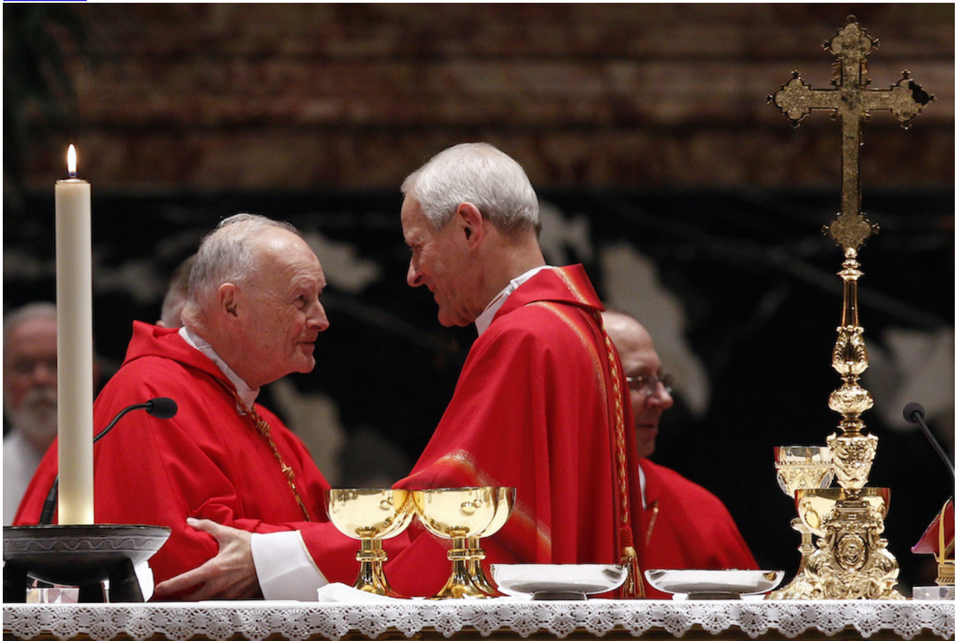
Cardinal Donald Wuerl of Washington, D.C., right, greets then-Cardinal Theodore McCarrick, retired archbishop of Washington, during the sign of peace at a Mass of thanksgiving in St. Peter's Basilica at the Vatican Nov. 22, 2010.