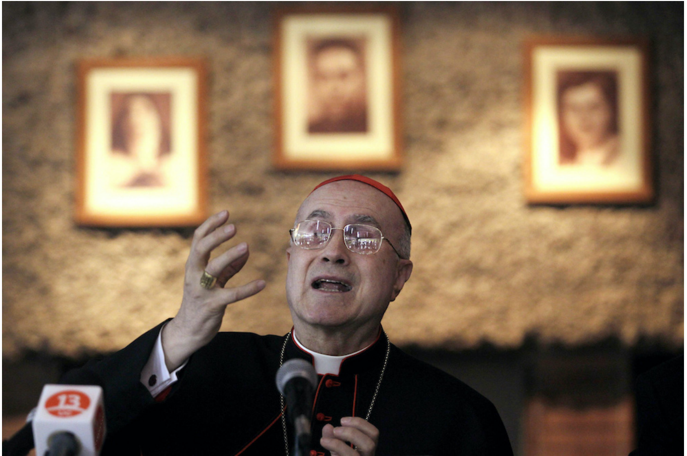
Cardinal Tarcisio Bertone, then-Vatican secretary of state, gestures during a news conference in Santiago, Chile, April 12, 2010.