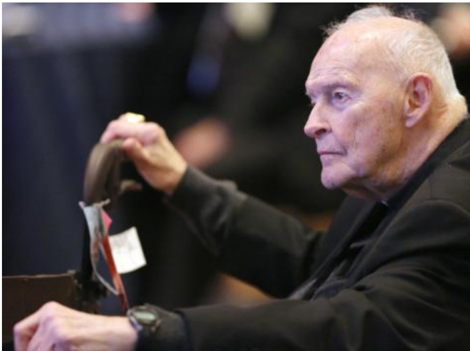
Theodore McCarrick is pictured in Baltimore, Maryland, in 2017.

The Vatican wants to release the document prior to the annual meeting of the U.S. Catholic bishops' conference, which is to be held virtually Nov. 16-17, said an informed Vatican source. The person asked not to be named as they did not have authorization to speak on the matter.