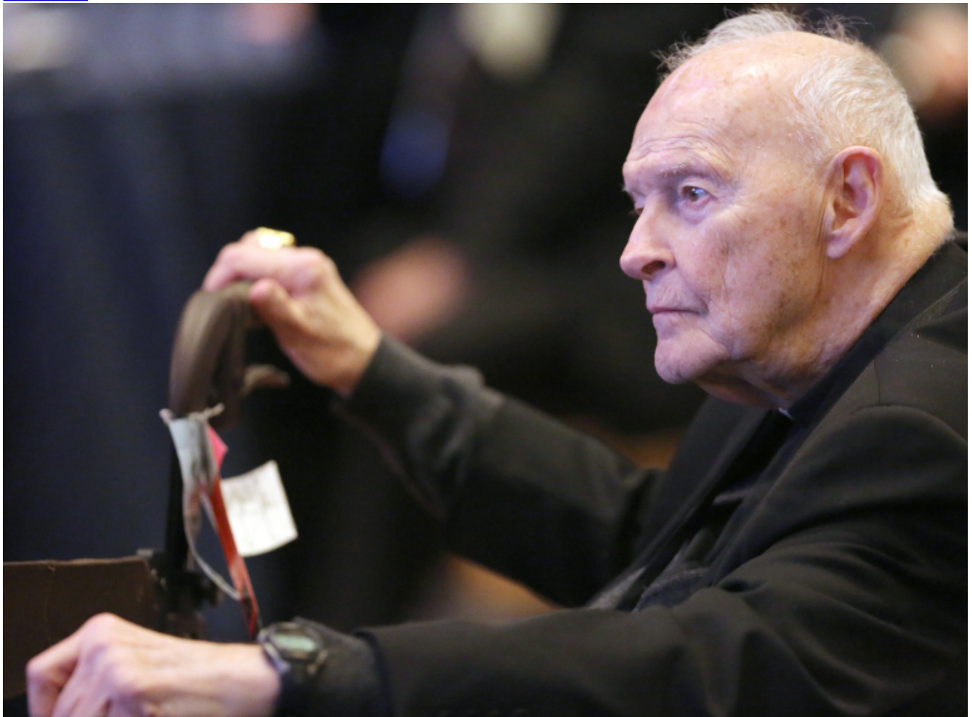
Theodore McCarrick is pictured in Baltimore, Maryland, in 2017.