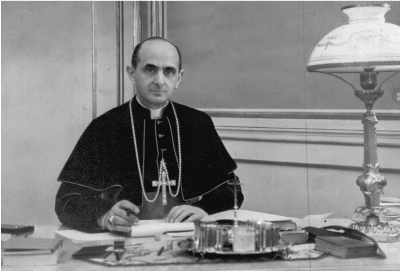
Cardinal Giovanni Battista Montini, who became Pope Paul VI