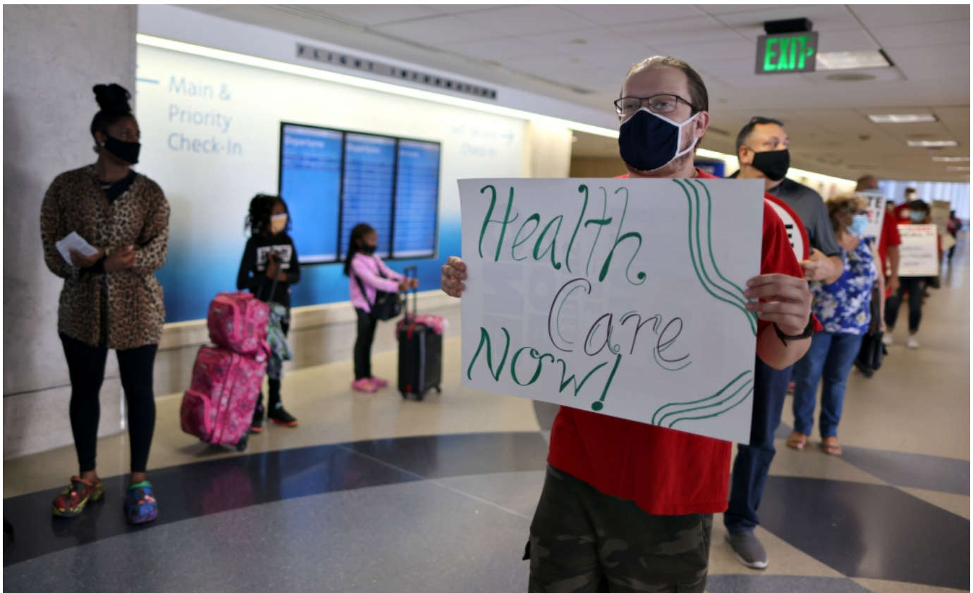
A person holds a sign as laid off LAX Airport workers protest for an extension of health care benefits by concessions companies in Los Angeles Sept. 24.

Trump also appoints anti-labor judges. Justice Neil Gorsuch and Justice Brett Kavanaugh have authored opinions that favor of corporations and undercut workers' rights. Legal and labor experts are decrying prospective U.S. Supreme Court justice Amy Coney Barrett's past rulings against workers and her potential to vote against the Affordable Care Act given her past criticism of it.