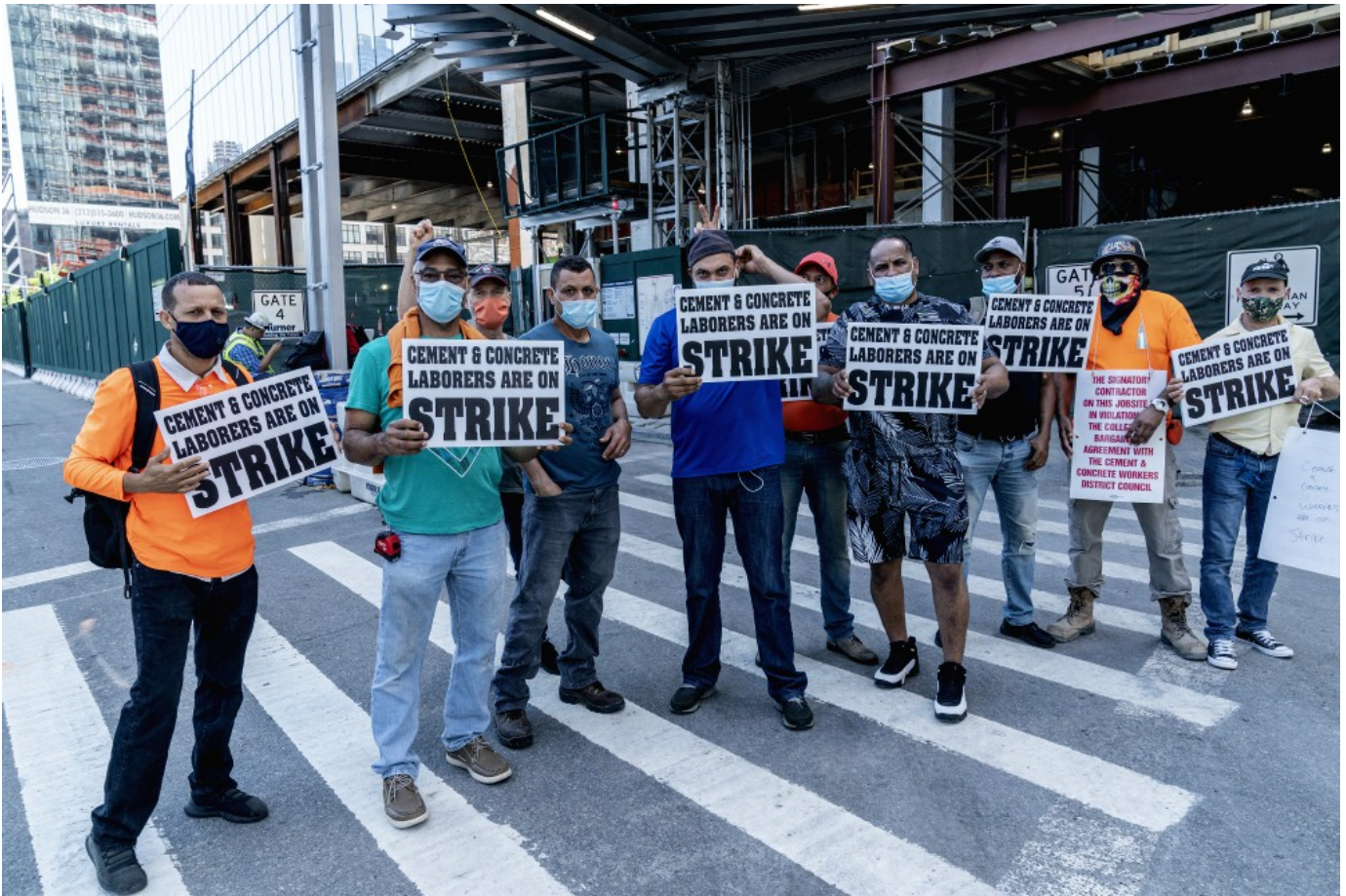
Union members in New York City hold a strike July 2.

St. John Paul II maintained in Laborem Exercens that by toiling as a manual laborer, Jesus revealed that the dignity and rights of all workers are sacred. Solidarity with workers is required to prove "fidelity to Christ." Thus, the church defends the rights necessary for "ensuring the life and health of workers and their families," such as a family living wage, health insurance, safe working conditions, and the right to unionize.