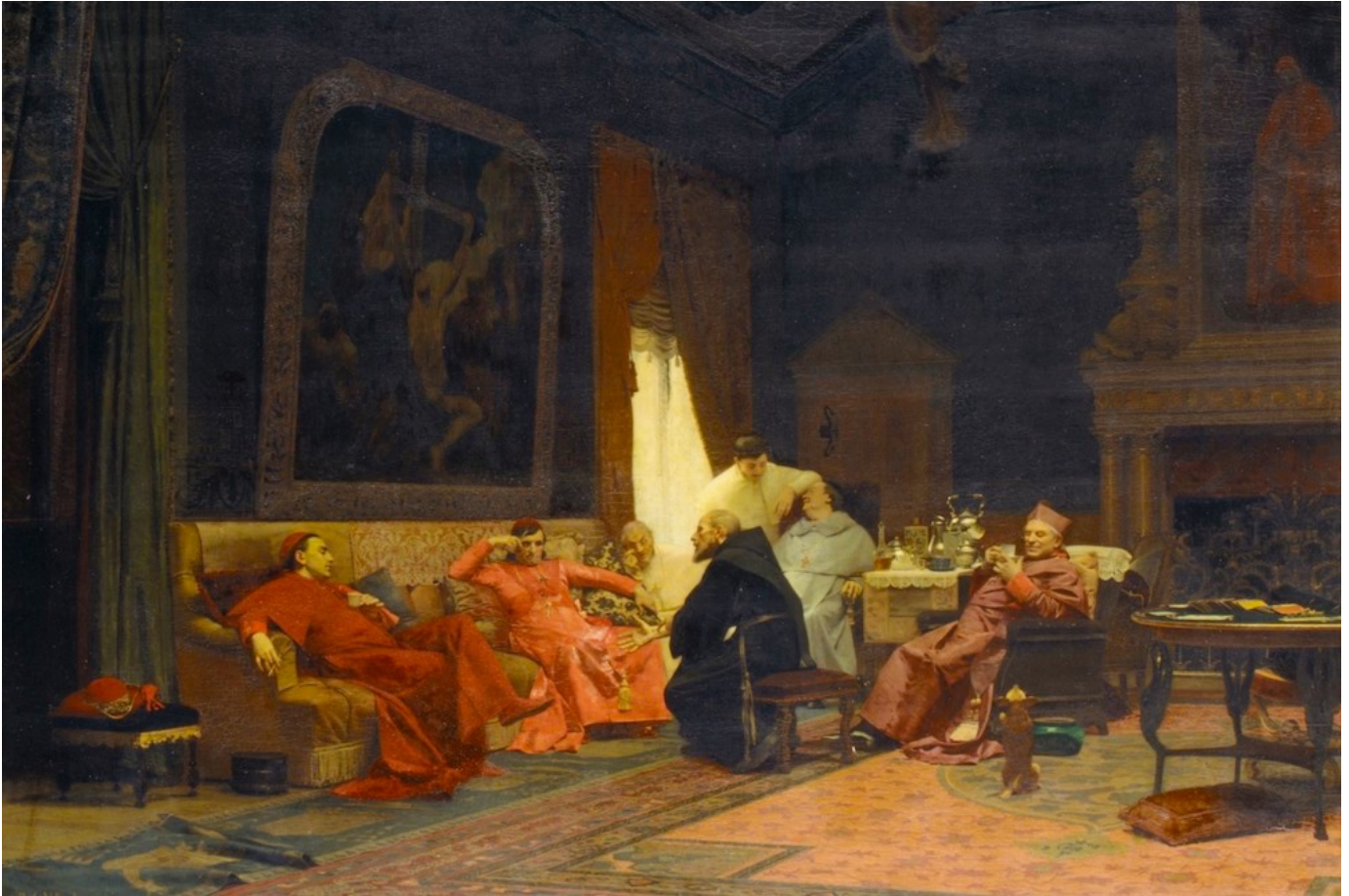
Detail of painting "The Missionary's Adventures" by Jean-Georges Vibert. circa 1883 (Metropolitan Museum of Art)