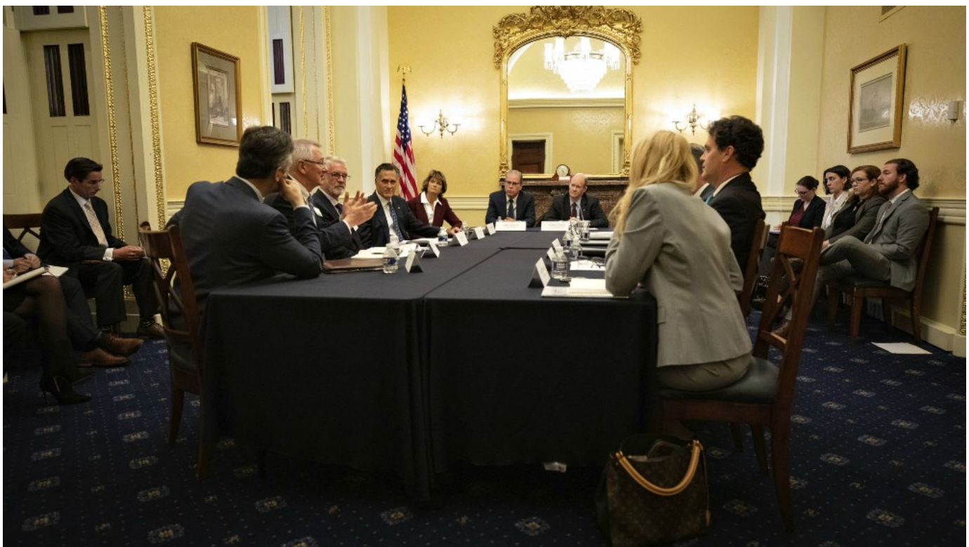
The Senate Climate Solutions Caucus meets in November 2019.

The Senate Climate Solutions Caucus formed in 2019, following the creation of a similar caucus in the House of Representatives three years earlier. The Senate version counts 14 of the 100 senators as members.