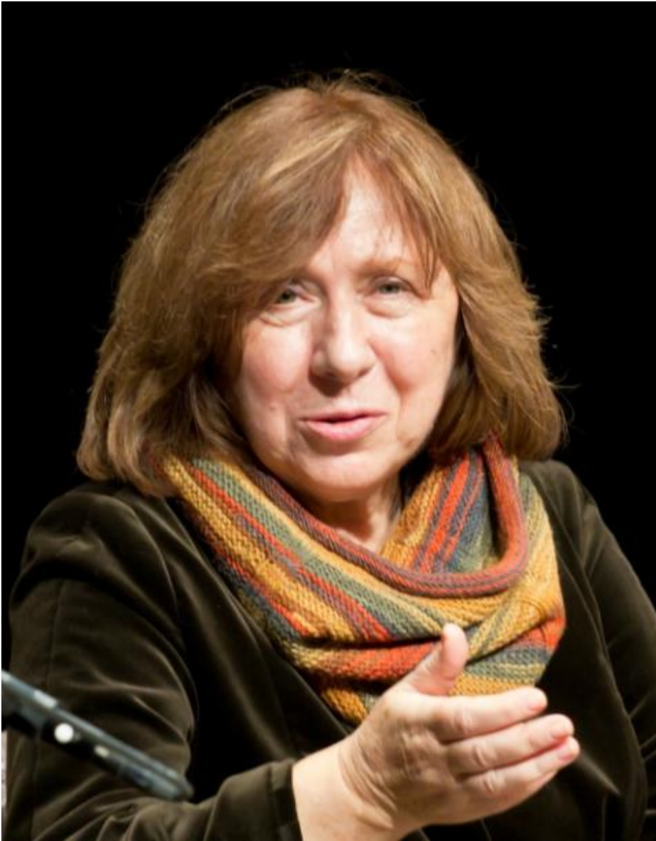
Svetlana Alexievich in 2013

The focus on the Soviet Union is more than sufficient as a subject, of course, and it fits in perfectly with Alexievich's larger project of focusing on Russian and Soviet history — "polyphonic writings, a monument to suffering and courage in our time," as the Nobel committee in 2015 so aptly put it.