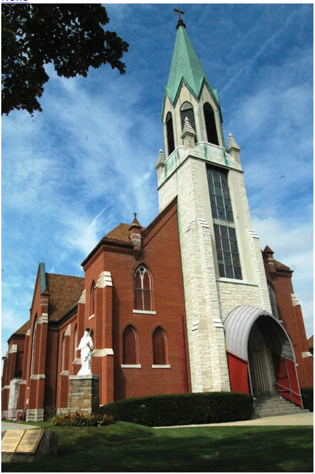
St. Stanislaus Church, South Bend, Indiana