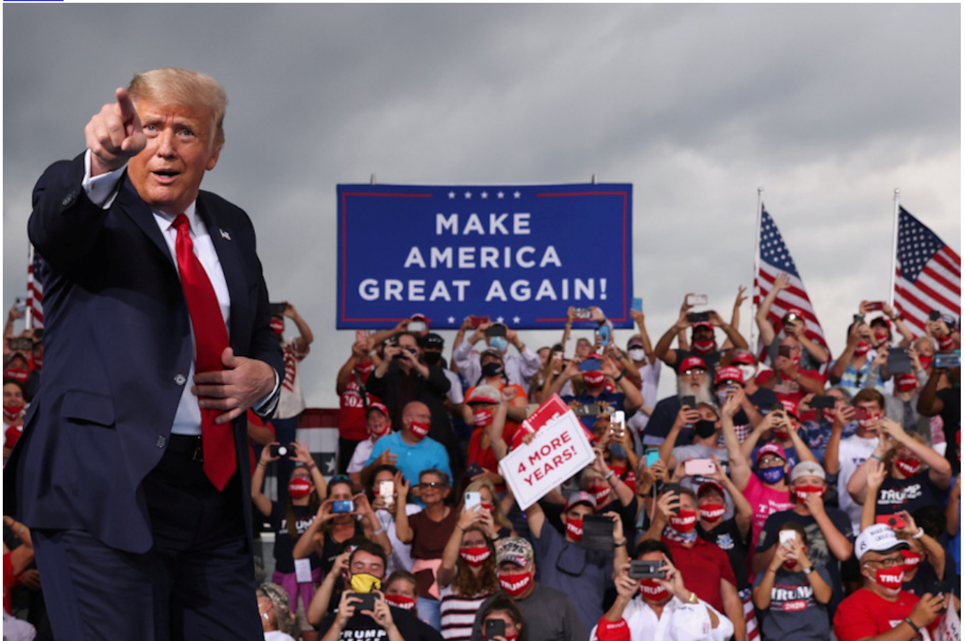
President Donald Trump campaigns at Smith Reynolds Regional Airport Sept. 8 in Winston-Salem, North Carolina.