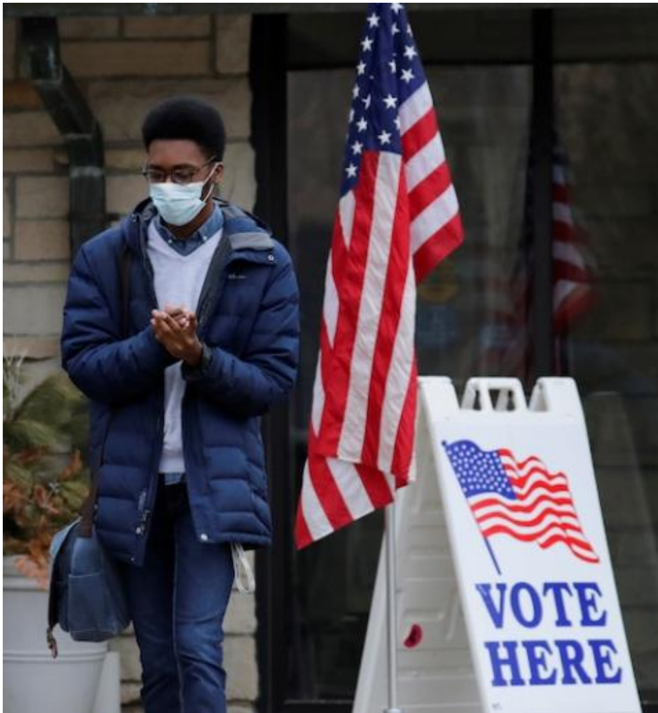
A student at Lawrence University in Appleton, Wisconsin, sanitizes his hands after voting in the presidential primary election April 7.