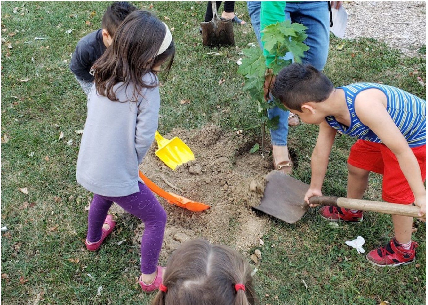
Children plant trees on the feast of St. Francis in October 2019 in Indianapolis.

Bartholomew issued a joint message urging political and business leaders to respond to pleas for "healing of our wounded creation." And in 2019, the pope participated in a tree planting in the Vatican Gardens ahead of the Amazon synod.