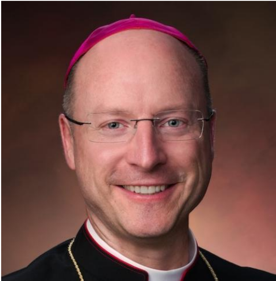
Bishop Shawn McKnight of Jefferson City, Missouri

"When priests come in from another country, they are priests. They are trained in Catholic theology like everyone [priests in the U.S.] but it is a different culture. It is a different ecclesial context," Okure said.