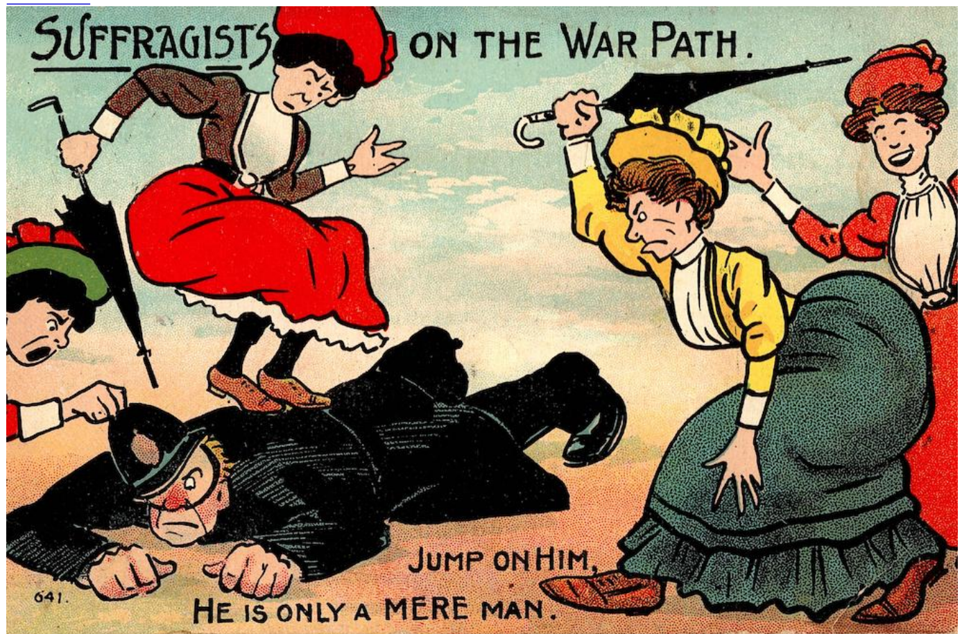
Anti-suffrage postcard