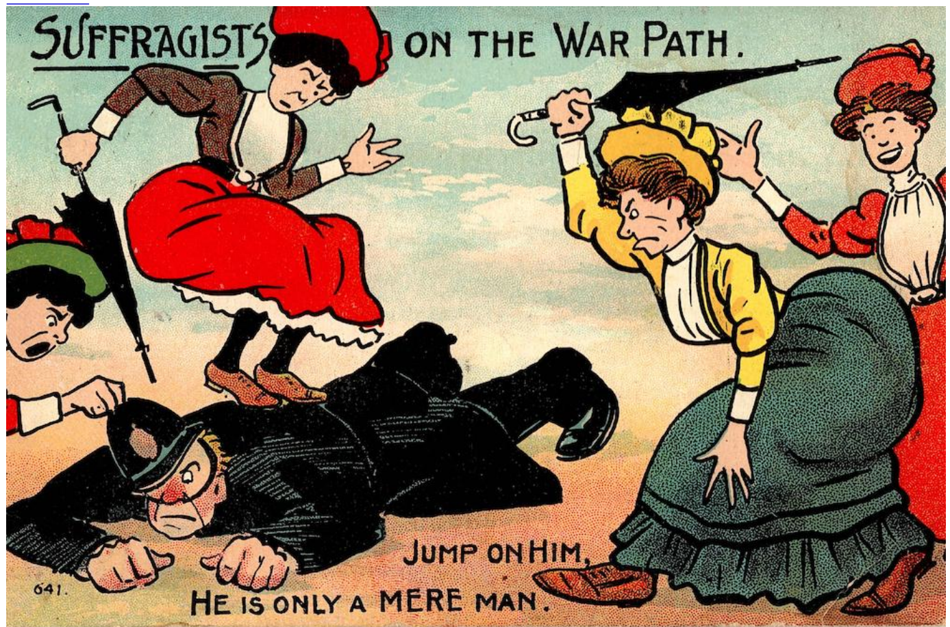
Anti-suffrage postcard