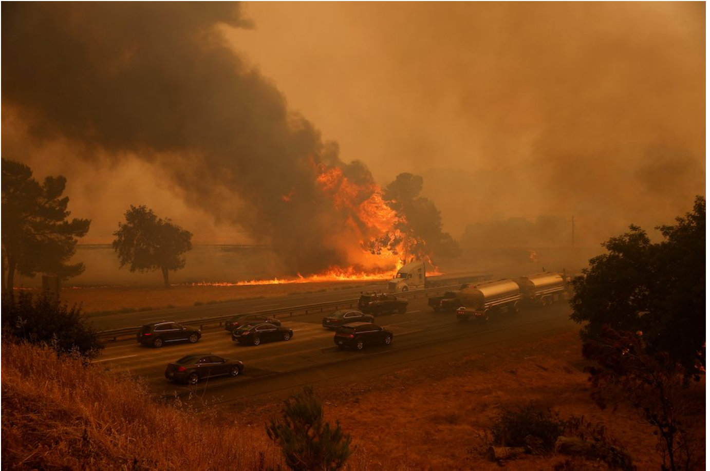
Flames from the LNU Lighting Complex Fire are seen along Interstate 80 near Vacaville, California, Aug. 19.

Biden's proposals on environmental issues, becoming bolder with his ascent to the nomination, have regularly come back to two words: jobs and justice. That focus has galvanized support from a broad coalition that includes environmental groups, unions, faith communities and people living with the daily reality of pollution in their neighborhoods.