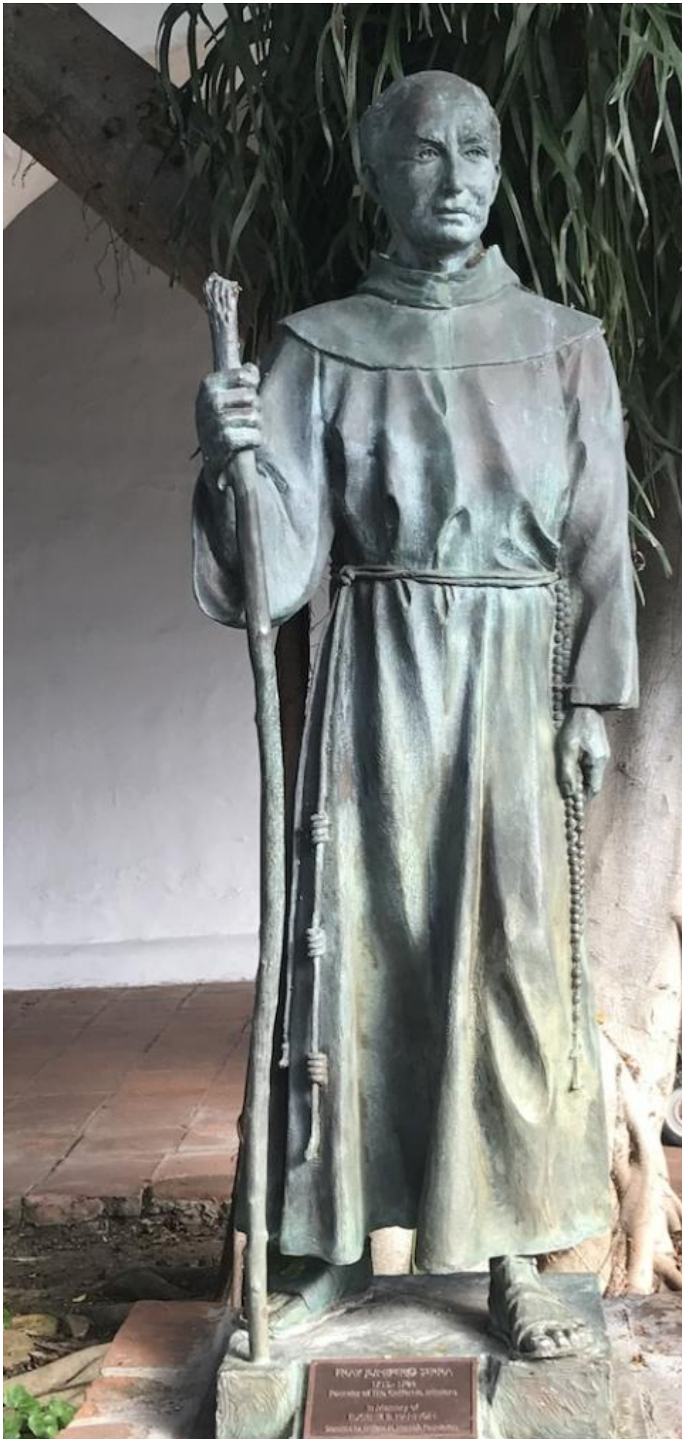
FRAY JACINTO SERRA 1713-1789 Parish of San Felipe, Monterey in memory of F. J. SERRA, B. L. S. J. O. S. A. San Francisco, California, 1961