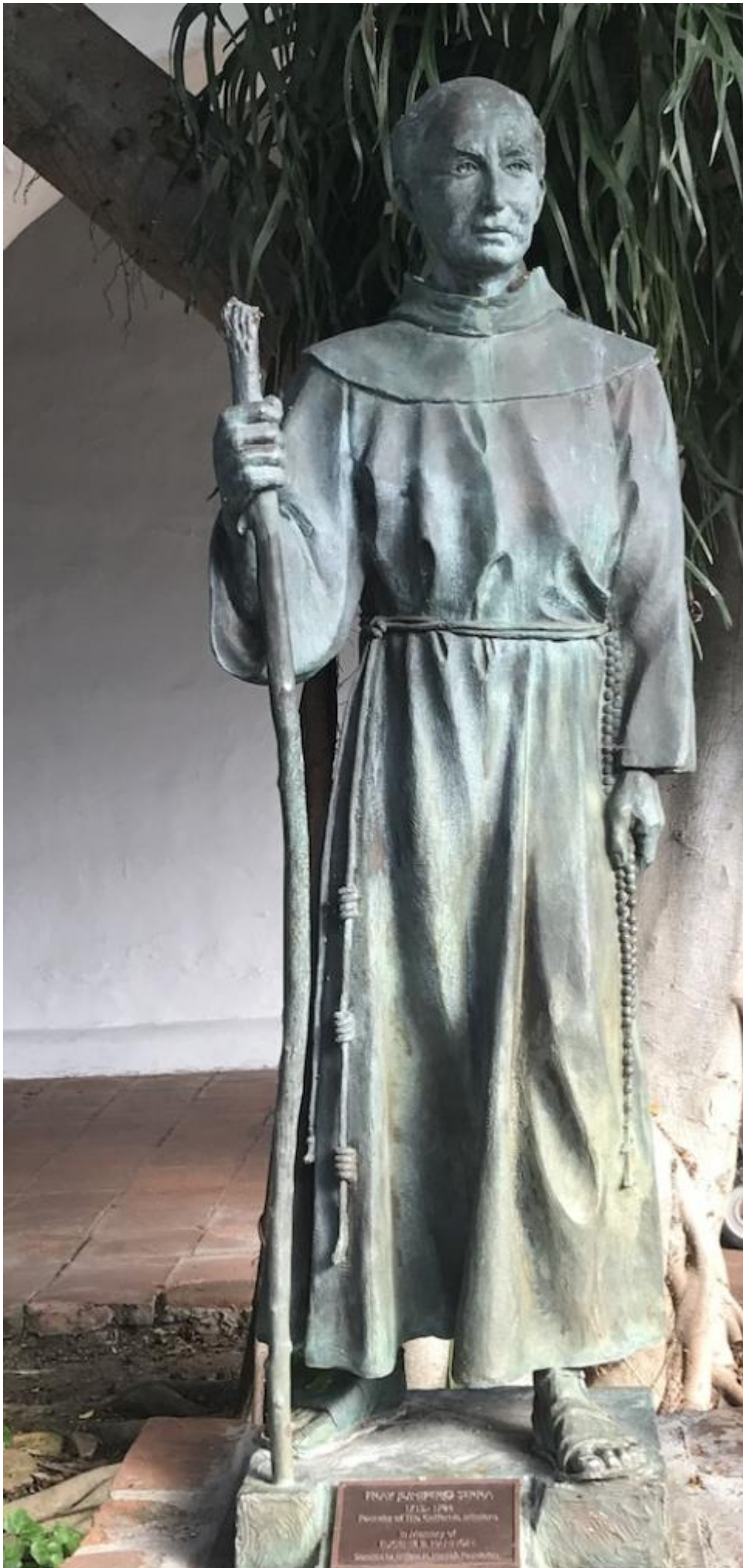
FRAY JACINTO SERRA 1713-1789 Parish of San Felipe, Monterey In Memory of F. J. SERRA, B. L. S. J. O. S. F. C. SANTA MONICA, CALIFORNIA, 1961