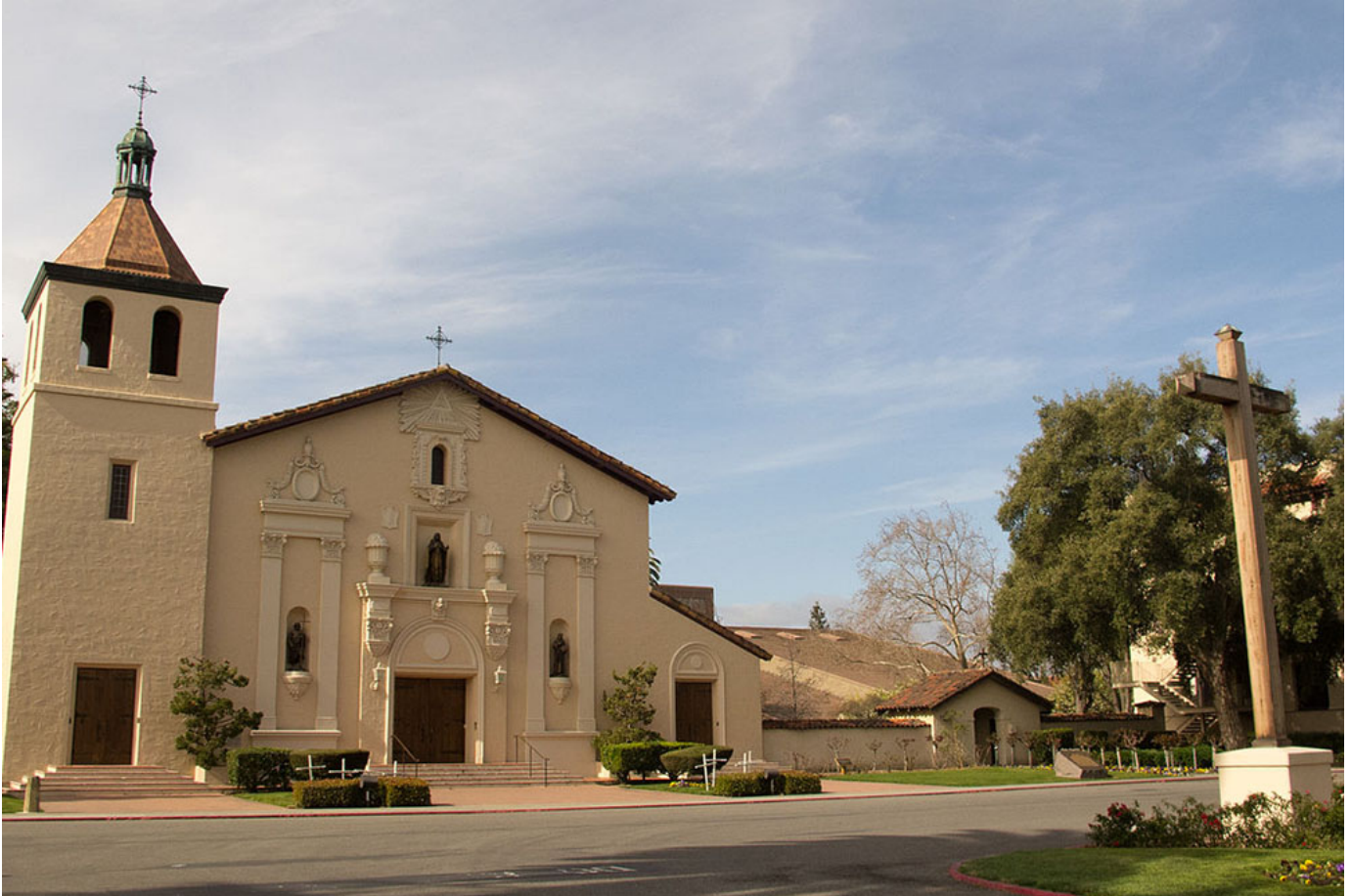
The Santa Clara Mission Church at Santa Clara University