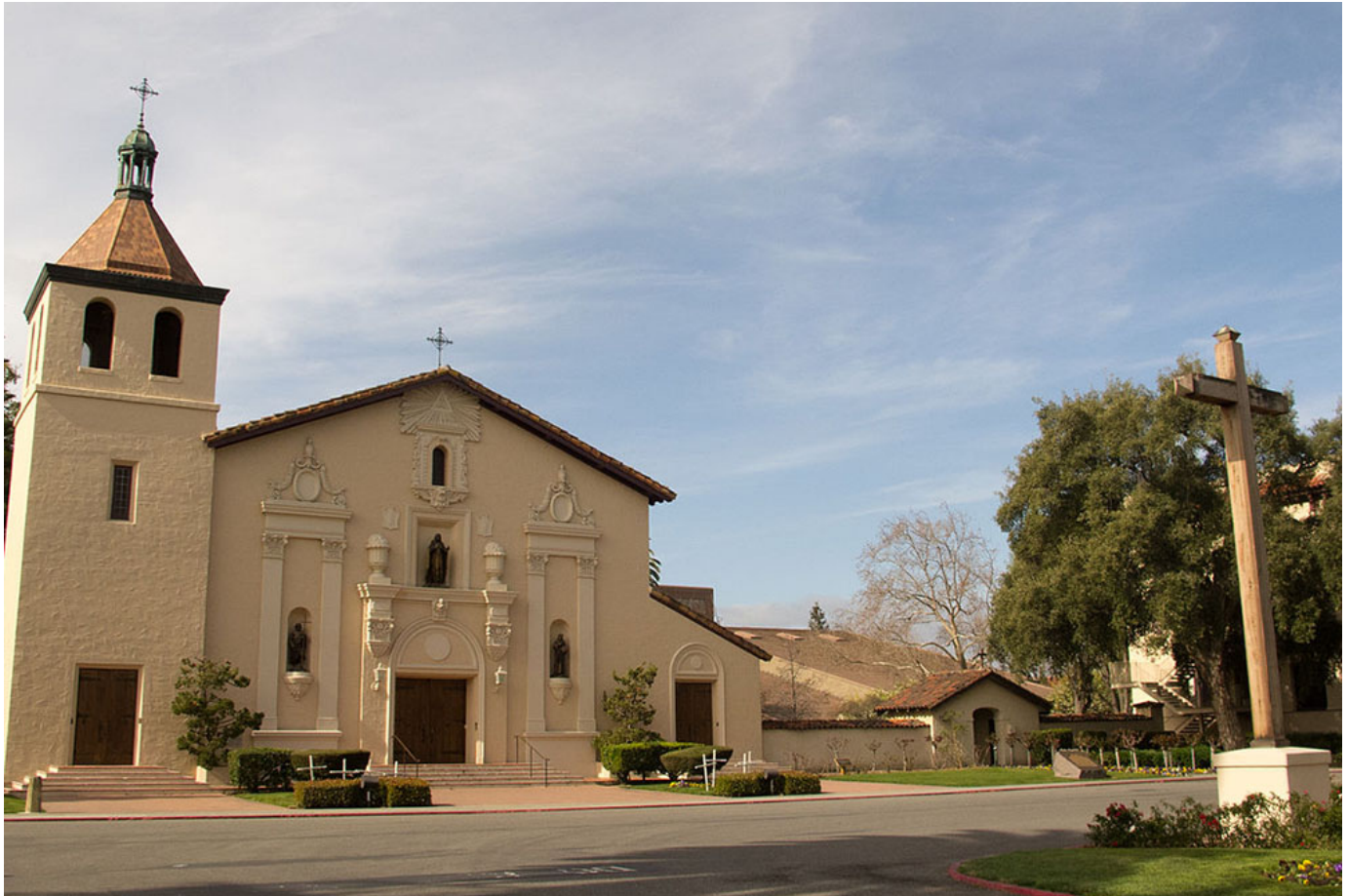
The Santa Clara Mission Church at Santa Clara University