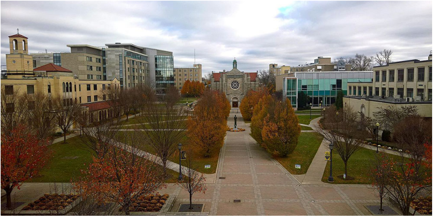
The quad at Canisius College in Buffalo, New York