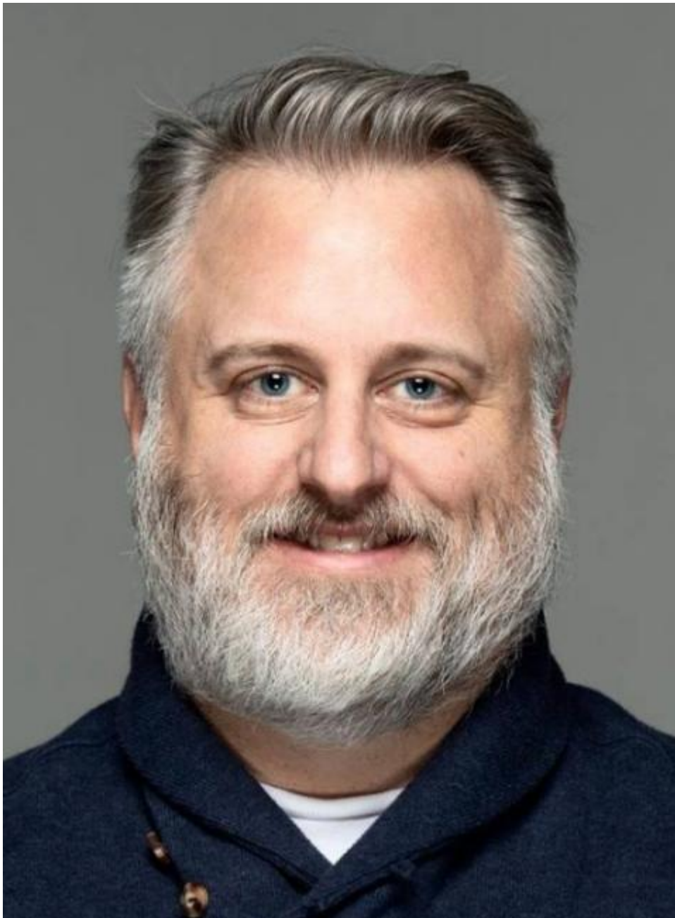
Hank Stuever (The Washington Post)