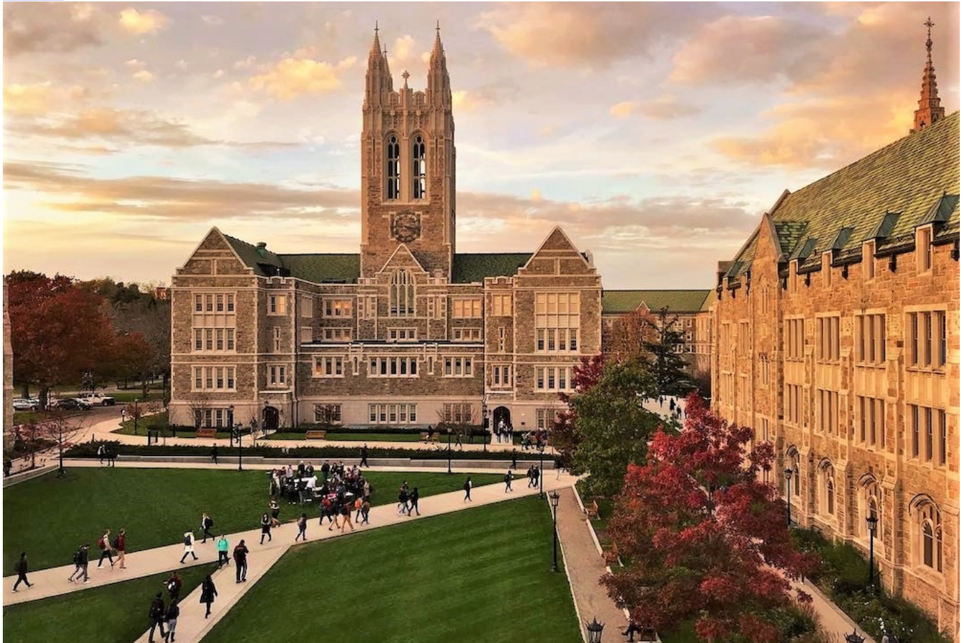
Gasson Quadrangle at Boston College