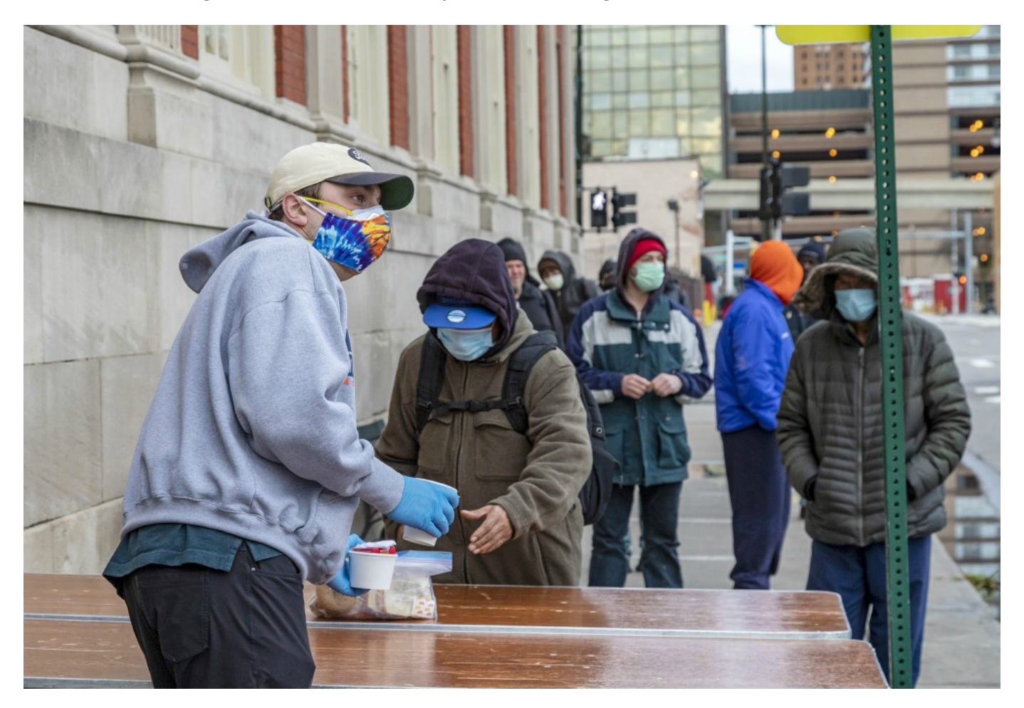
Homeless people in Detroit get hot meals and other help at the Pope Francis Center May 1.

This means that a conscientious Catholic voter cannot be satisfied with low taxes and a high market return. The goods we have, including those we have earned by hard work, only belong to us in a sense. There is a logic of the market, to be sure, but there is also a "logic of gift," as Pope Benedict XVI noted in his encyclical <u>Caritas in Veritate</u>. This is not just charity, but justice, born of a conviction that the goods of the Earth belong to all, and that the poorest among us have the first claim on them.