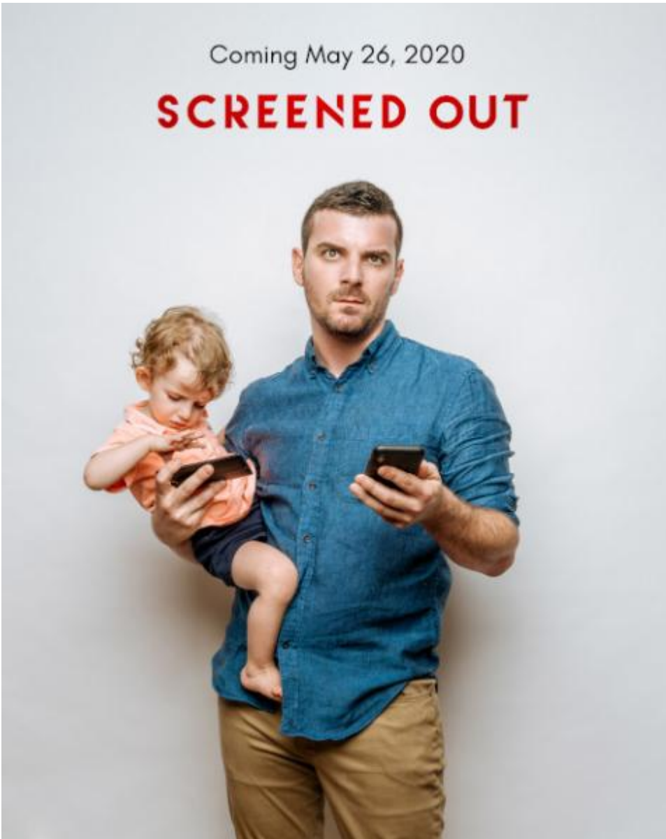
Poster for "Screened Out"

Sean Parker, former president of Facebook, says in the film that "these tools rip apart the social fabric of what society has created." He says that Facebook knew very well about how checking a user's "likes" and "loves" would provide a dopamine hit as part of the "social validation feedback loop" that our brains crave. The hook cycle starts with a trigger, the action phase, in anticipation of a reward that will make you feel good. When our smartphones alert us to any kind of message, they prompt us to respond immediately in anticipation of that reward.