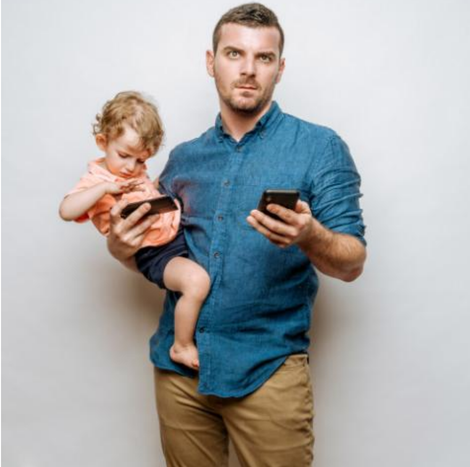
Poster for "Screened Out"

Sean Parker, former president of Facebook, says in the film that "these tools rip apart the social fabric of what society has created." He says that Facebook knew very well about how checking a user's "likes" and "loves" would provide a dopamine hit as part of the "social validation feedback loop" that our brains crave. The hook cycle starts with a trigger, the action phase, in anticipation of a reward that will make you feel good. When our smartphones alert us to any kind of message, they prompt us to respond immediately in anticipation of that reward.