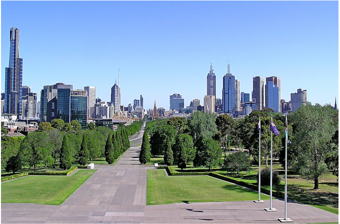
Shrine of Remembrance, Melbourne, Australia.