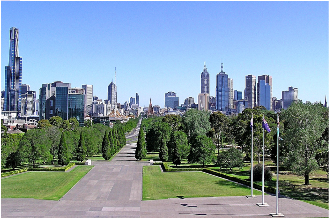
Shrine of Remembrance, Melbourne, Australia.