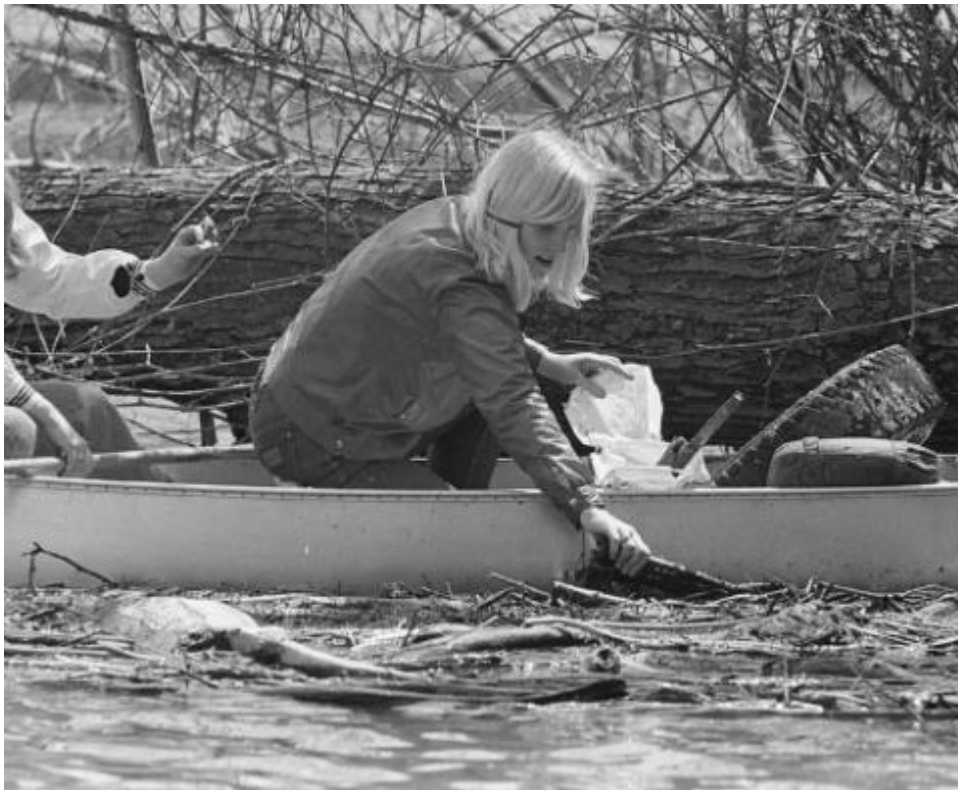
A Girl Scout in a canoe picks trash out of the Potomac River during Earth Week in April 1970.

An estimated 20 million Americans took part in that first Earth Day, representing at the time one-tenth of the U.S. population. Scattered among them were many Catholics and people of faith. The staff coordinating Earth Day encouraged local organizers to reach out to the faith community, well aware of the "huge role" they played in launching the civil rights and anti-war movements, recalled Denis Hayes, who was in 1970 the 25-year-old Harvard graduate student Nelson appointed as national organizer.