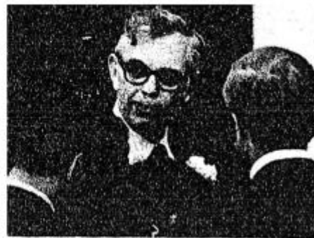
GILBERT GUDE (R-MD), keynote speaker for "Earth Day" here on campus as he entered McFaban auditorium before his speech. The speech followed the "Action Mass" and preceded other events scheduled on campus in connection with the day.

to people with the sense to see the dangers of pollution and the discipline to do something about it."