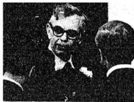
GILBERT GUDE (R-MD), keynote speaker for "Earth Day" here on campus as he entered McFaban auditorium before his speech. The speech followed the "Action Mass" and preceded other events scheduled on campus in connection with the day.

to people with the sense to see the dangers of pollution and the discipline to do something about it."