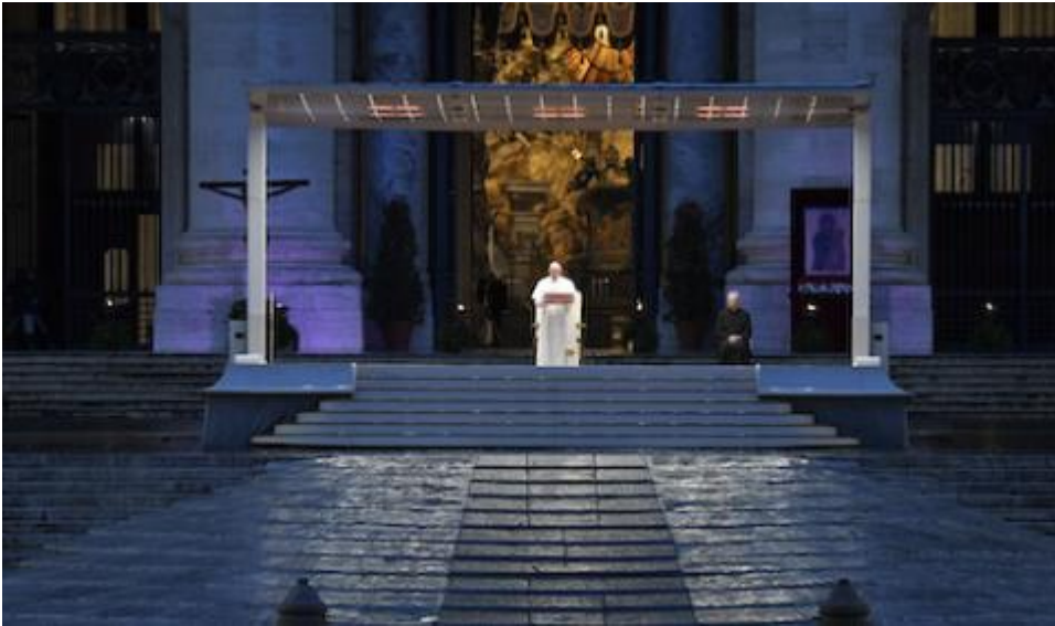
Pope Francis leads a prayer service in an empty St. Peter's Square at the Vatican March 27.

Fortunately, good pastoral sense prevails in many places. Some women religious communities are conducting funeral services without benefit of clergy. A sister dies in a motherhouse, and the leadership team handles the wake, funeral and burial. The leaders, and perhaps a few close friends of the deceased (not to exceed the limits of how many can gather legally in the locale) carry out a dignified celebration of the person's life. After the service, they process to the cemetery for the final prayers and burial. It is livestreamed throughout the motherhouse and to friends and family at a distance, providing as much comfort as possible.