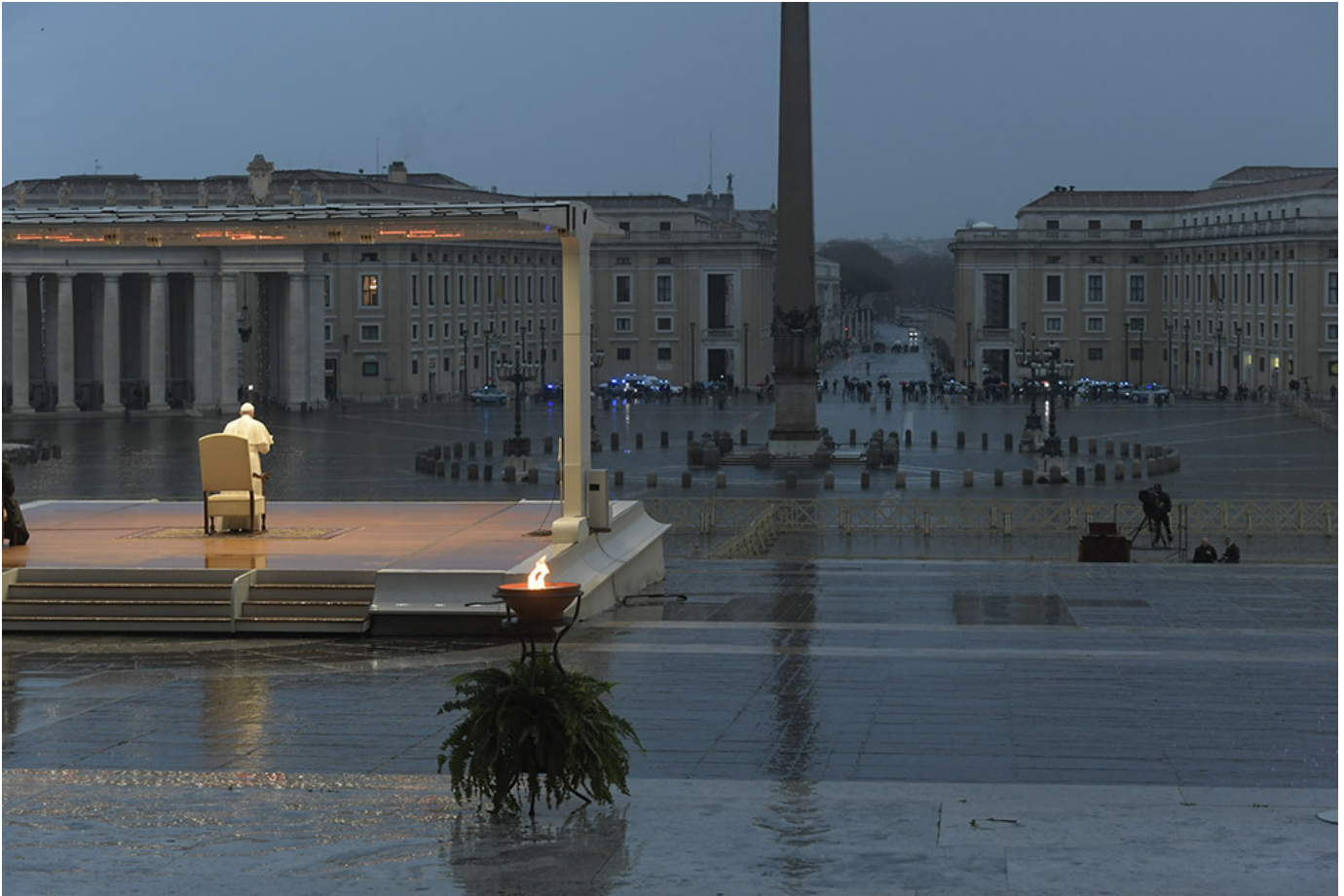
Pope Francis leads a prayer service in an empty St. Peter's Square at the Vatican March 27.

These sorts of contrarian arguments are emblematic of a small but vocal crowd of pandemic naysayers in the church that, wittingly or otherwise, reduce everything from church buildings to even the Eucharist itself into symbols of a growing idolatry that minimizes God and restricts God's presence to a limited number of discrete locations. It's true that Christ is uniquely present in the Blessed Sacrament, but it's not true that this is the only way God draws near to humanity and the rest of creation. God's grace is not scarce nor is God distant from us!