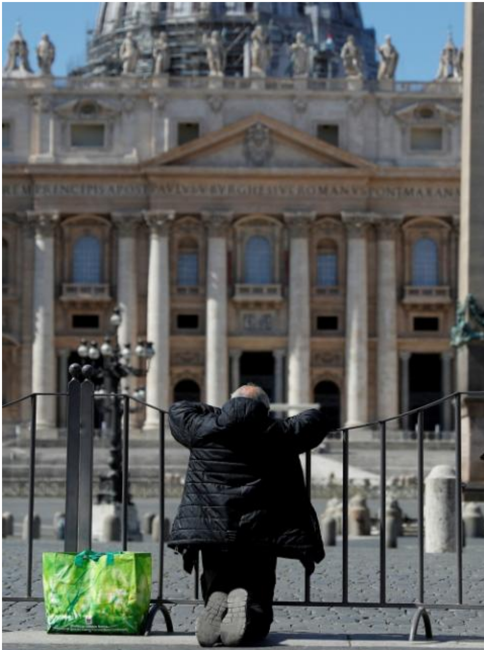
A man prays in front of an empty St. Peter's Square in Rome March 25.

For Catholics, the spring also brings the fifth anniversary of Pope Francis' social encyclical on ecology, " Laudato Si' , on Care for Our Common Home," with the Vatican sponsoring a weeklong celebration to rally the church to greater steps to care for God's creation.