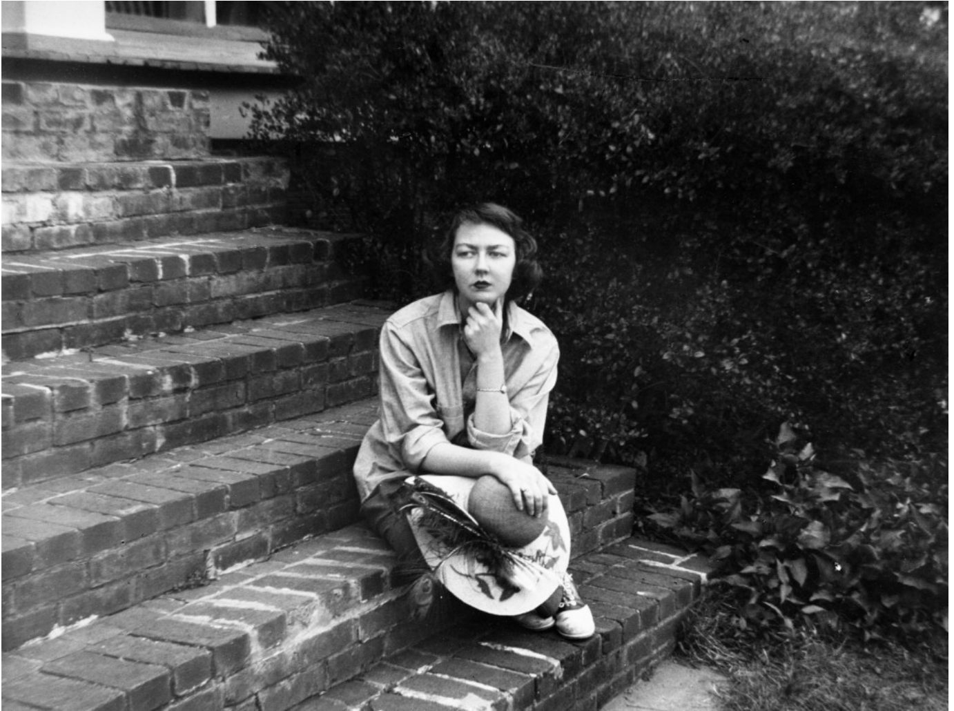
Catholic writer Flannery O'Connor sits on the steps of her home in Milledgeville, Georgia, Sept. 22, 1959.