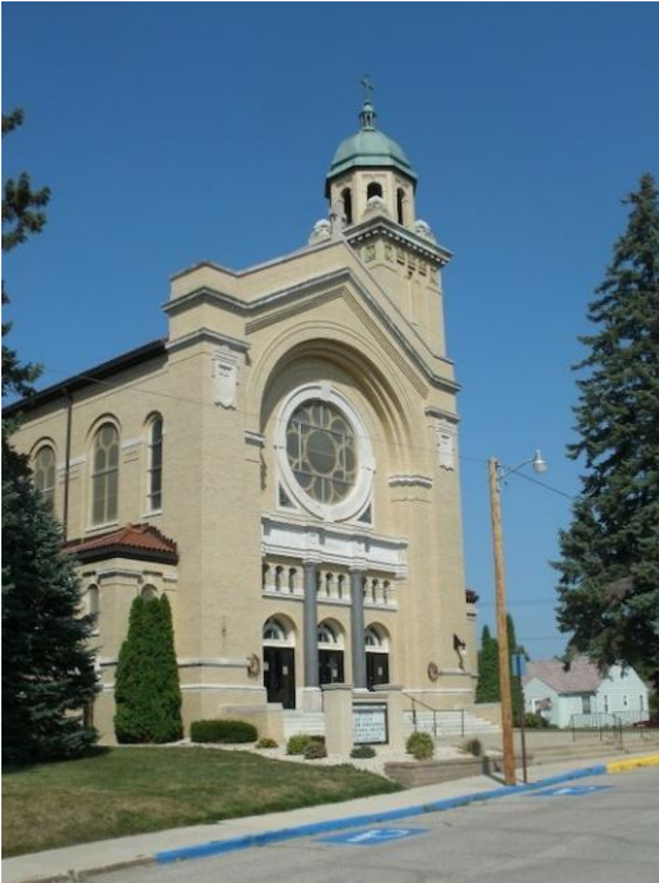
Screenshot of St. Patrick Parish church in Waukon, Iowa, from their website