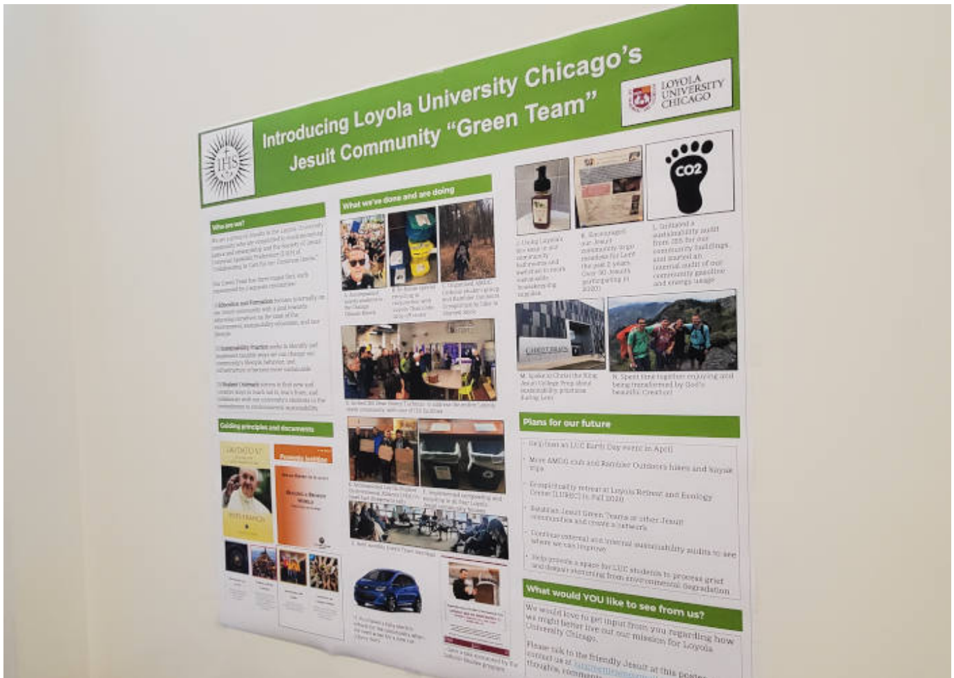
A poster highlights steps taken by the "green team" of the Jesuit community at Loyola University Chicago during a climate workshop at the campus' Institute for Environmental Sustainability.