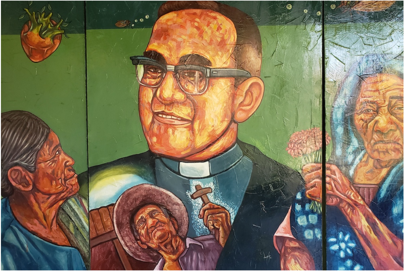
This painting of Óscar Romero is at a museum dedicated to peace in the town of Suchitoto, El Salvador.