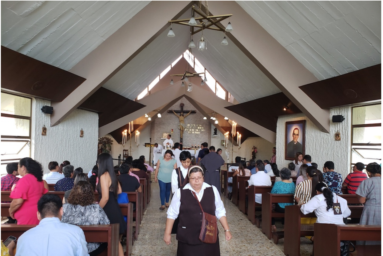
A chapel service takes place at the Hospital de la Divina Providencia, where St. Óscar Romero lived and where he celebrated his last Mass on March 24, 1980.

"He would see gang members as humans meant to be loved and that what they are doing [in committing crimes] is due to the lack of love in their hearts," she said. "I think Romero would say, 'You are people who need love, but you need to stop hurting and killing people.' "