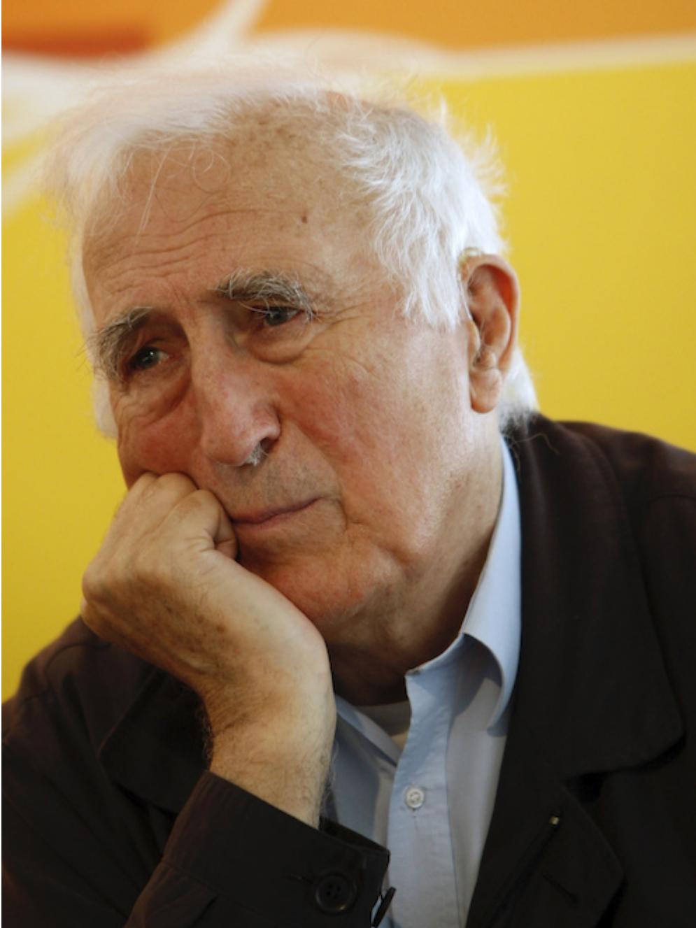
Jean Vanier, founder of the L'Arche communities, is pictured in a June 16, 2008, photo.