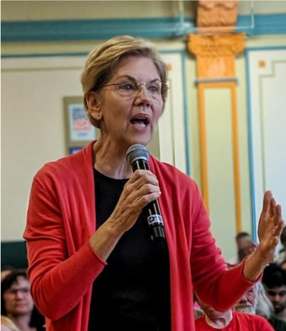
Sen. Elizabeth Warren in Nashua, New Hampshire, May 2019

create our own families. I believe that it is Warren's approach, not harsh and restrictive laws enforced mainly by often hypocritical men, that is the better, if imperfect, reflection of family values.