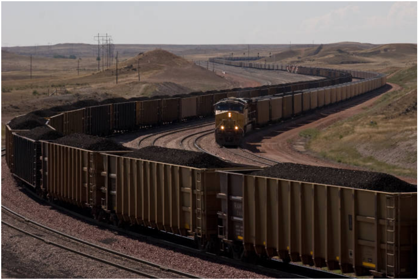
Giant coal trains pass near North Antelope Rochelle Mine in Campbell County, Wyoming, in this 2009 image.