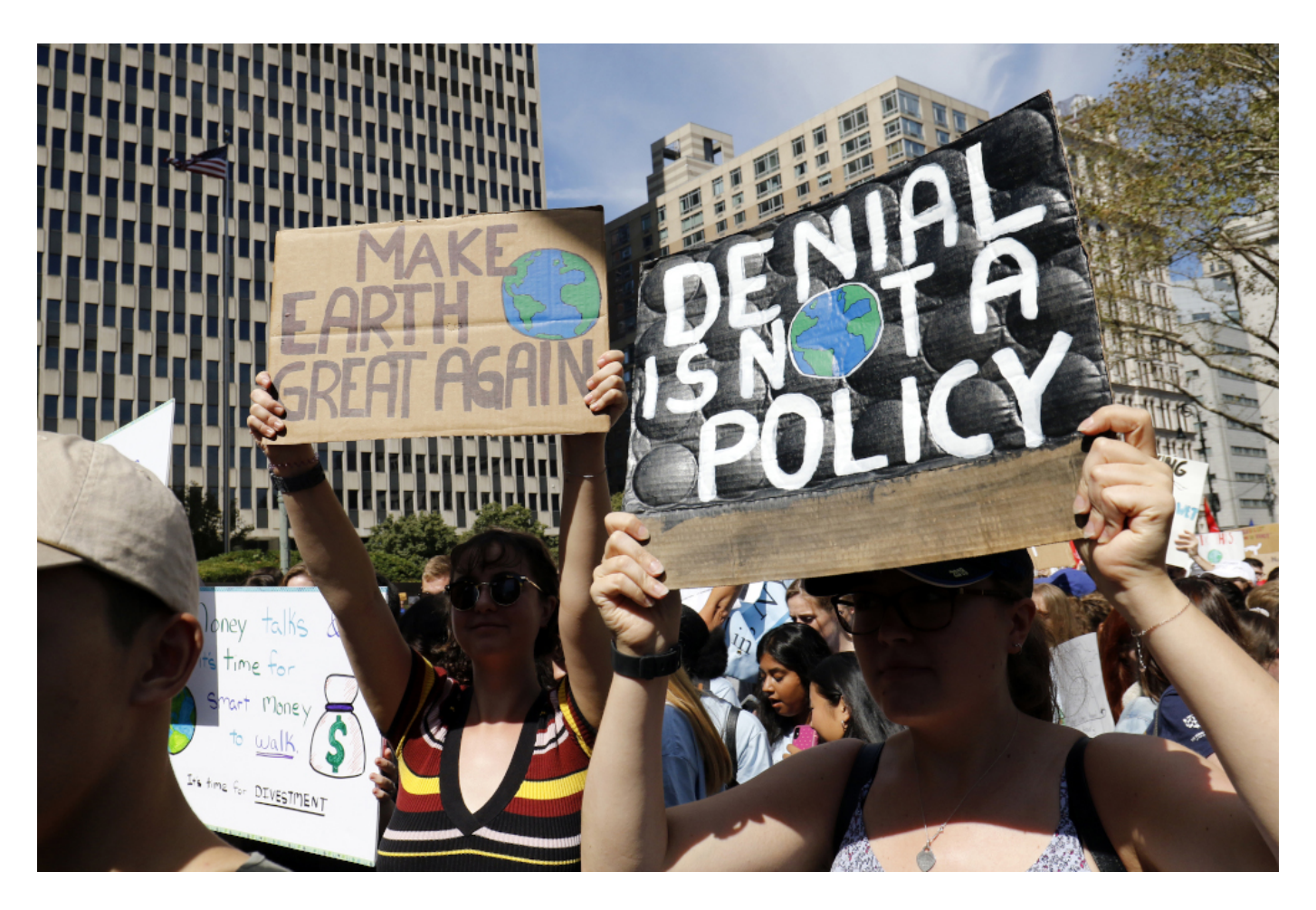
Young women hold signs while participating in the Global Climate Strike in New York City Sept. 20, 2019.

At the same time there is a clear international scientific consensus that climate change caused by the use of fossil fuels and other human activities poses an existential threat to the very future of humanity and that air pollution resulting from fossil fuels is already a major cause of premature death on our planet. Existing trajectories of pollutants being placed in the atmosphere by human activity, if unchecked, will raise the temperature of the earth in the coming decades, generating catastrophic rises in human exposure to deadly heat, devastating rises in water levels and massive exposure to a series of perilous viruses. In addition, there will be severe widespread famines, draughts and massive dislocations of peoples that will cause untold deaths, human suffering and violent conflict. The devastating fires in Australia are a sign of what lies before us, and a testimony that, on so many levels, our current pollution of the earth is stealing the future from coming generations. Because the trajectory of danger unleashed by fossil fuels is increasing so rapidly, the next ten years are critical to staunching the threat to our planet. The