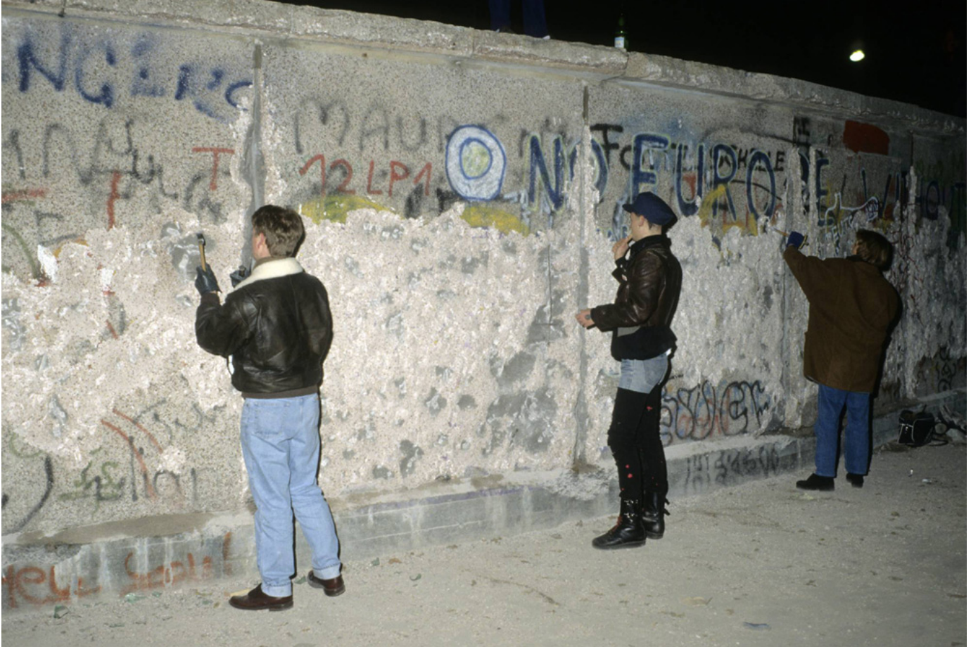
People with hammers hit the remaining wall Dec. 31, 1989, in Berlin, Germany.