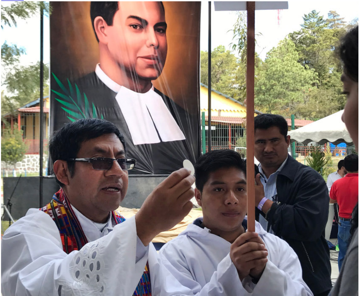
A clergyman distributes Communion during the beatification Mass of Blessed James Miller in Huehuetenango, Guatemala.