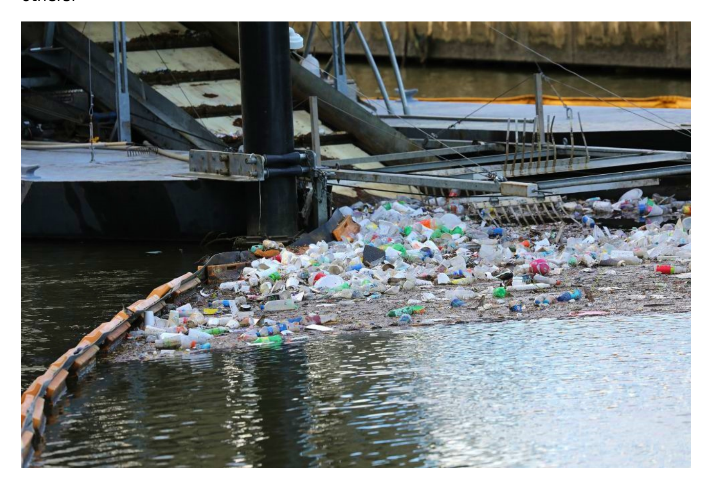
A worker collects trash in a containment along Baltimore's Inner Harbor June 11.

solving these problems, in fact proves incapable of seeing the mysterious network of relations between things and so sometimes solves one problem only to create others."