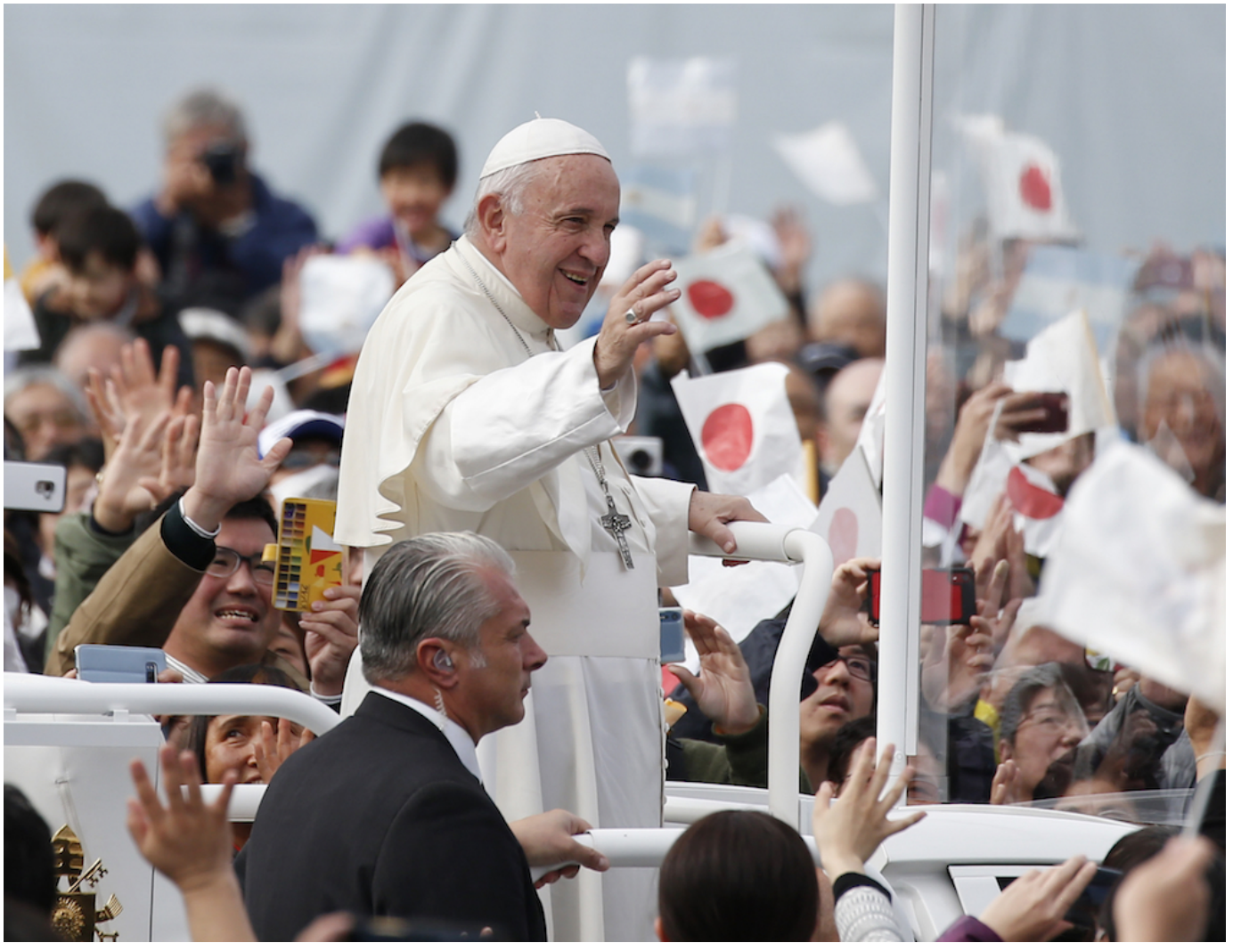
Pope Francis greets the crowd before celebrating Mass at the baseball stadium in Nagasaki, Japan, Nov. 24.

"This land has experienced, as few countries have, the destructive power of which we humans are capable," the pope said in his homily. "Nagasaki bears in its soul a wound difficult to heal, a scar born of the incomprehensible suffering endured by so many innocent victims of wars past and those of the present, when a third World War is being waged piecemeal."