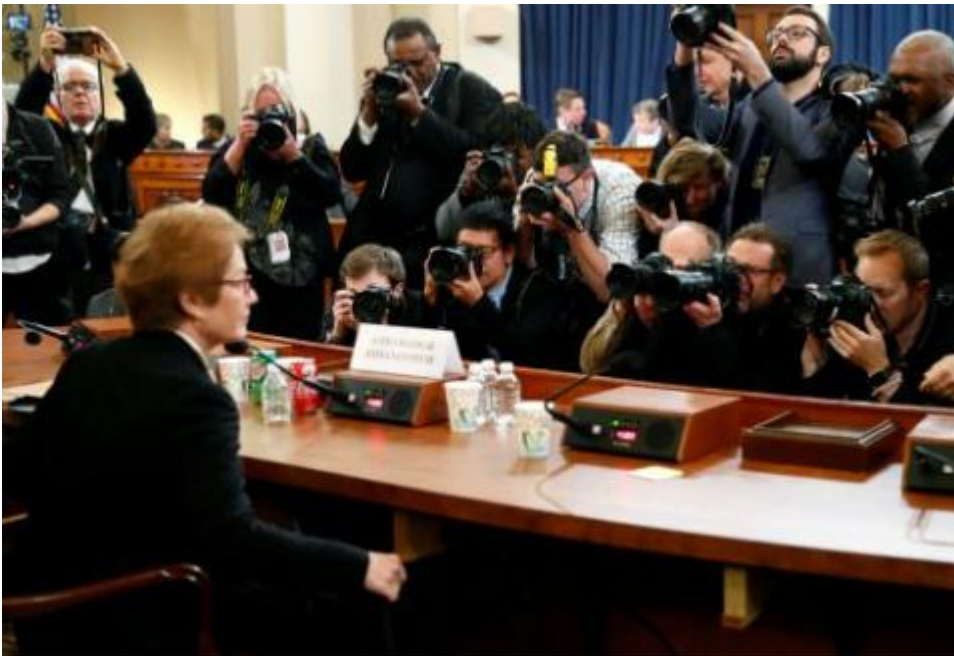
Marie Yovanovitch, former U.S. ambassador to Ukraine, testifies Nov. 15 in Washington before a House Intelligence Committee hearing as part of the

As morally repugnant as Trump's pardons were, they were matched in ethical grotesqueness by his attacks on lifelong patriots who have served this country in a variety of challenging circumstances.