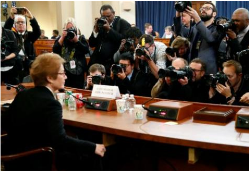
Marie Yovanovitch, former U.S. ambassador to Ukraine, testifies Nov. 15 in Washington before a House Intelligence Committee hearing as part of the

As morally repugnant as Trump's pardons were, they were matched in ethical grotesqueness by his attacks on lifelong patriots who have served this country in a variety of challenging circumstances.