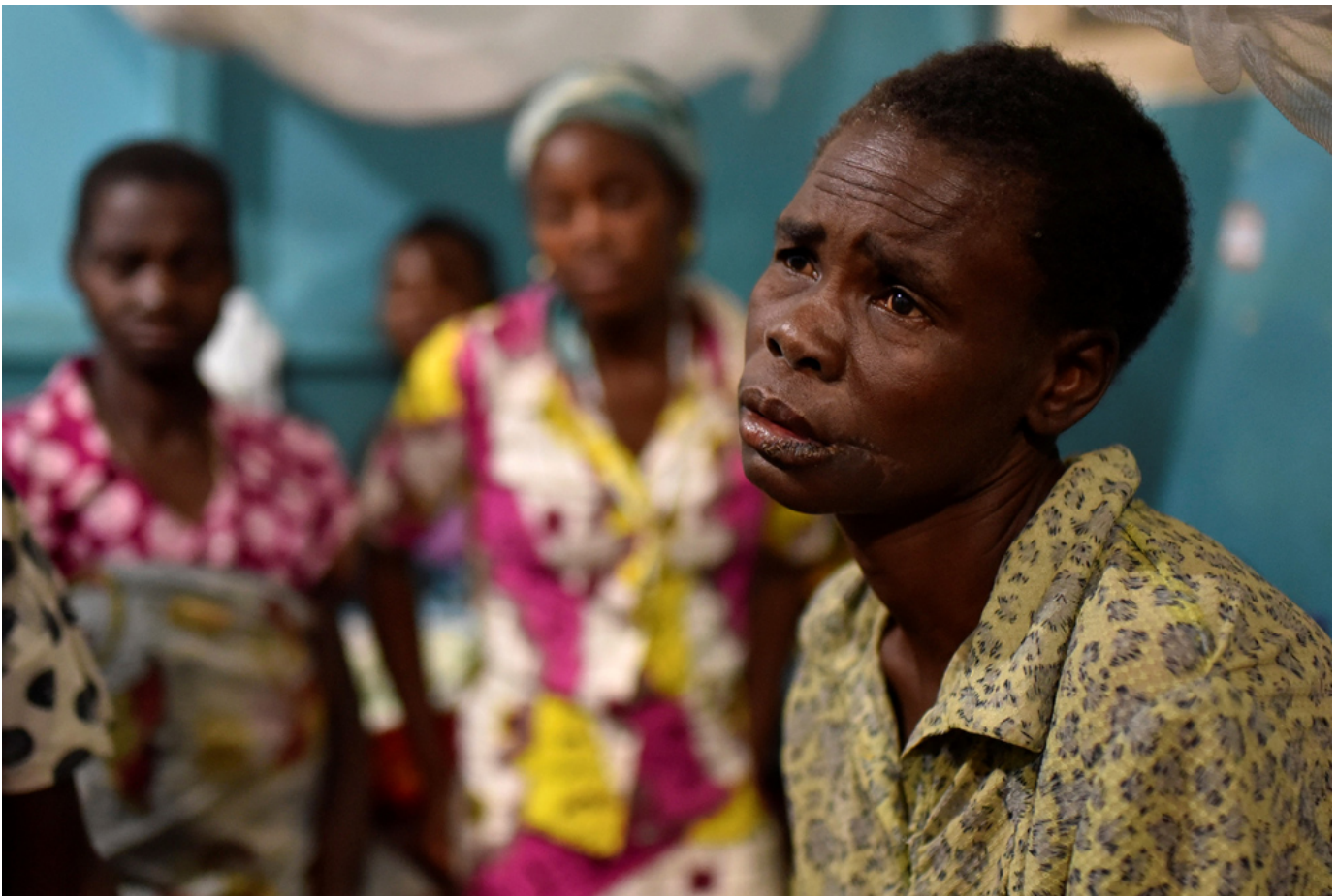
A victim of ethnic violence rests inside a hospital on June 25 in Bunia, Congo.

"We do have the opportunity to do [go to detention centers]. But the centers are at very high capacity. And there are a lot of people with so many needs. Even asylum claimers are in detention, which shouldn't be like that, but that's the policy," she said.