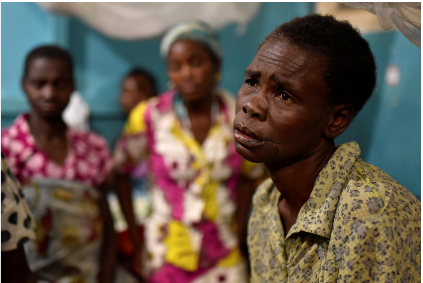
A victim of ethnic violence rests inside a hospital on June 25 in Bunia, Congo.

"We do have the opportunity to do [go to detention centers]. But the centers are at very high capacity. And there are a lot of people with so many needs. Even asylum claimers are in detention, which shouldn't be like that, but that's the policy," she said.