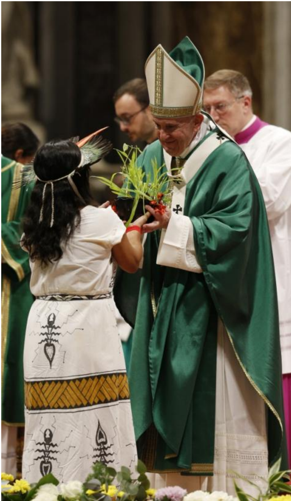
Pope Francis accepts a plant during the offertory as he celebrates the concluding Mass of the Synod of Bishops for the Amazon at the Vatican Oct. 27.