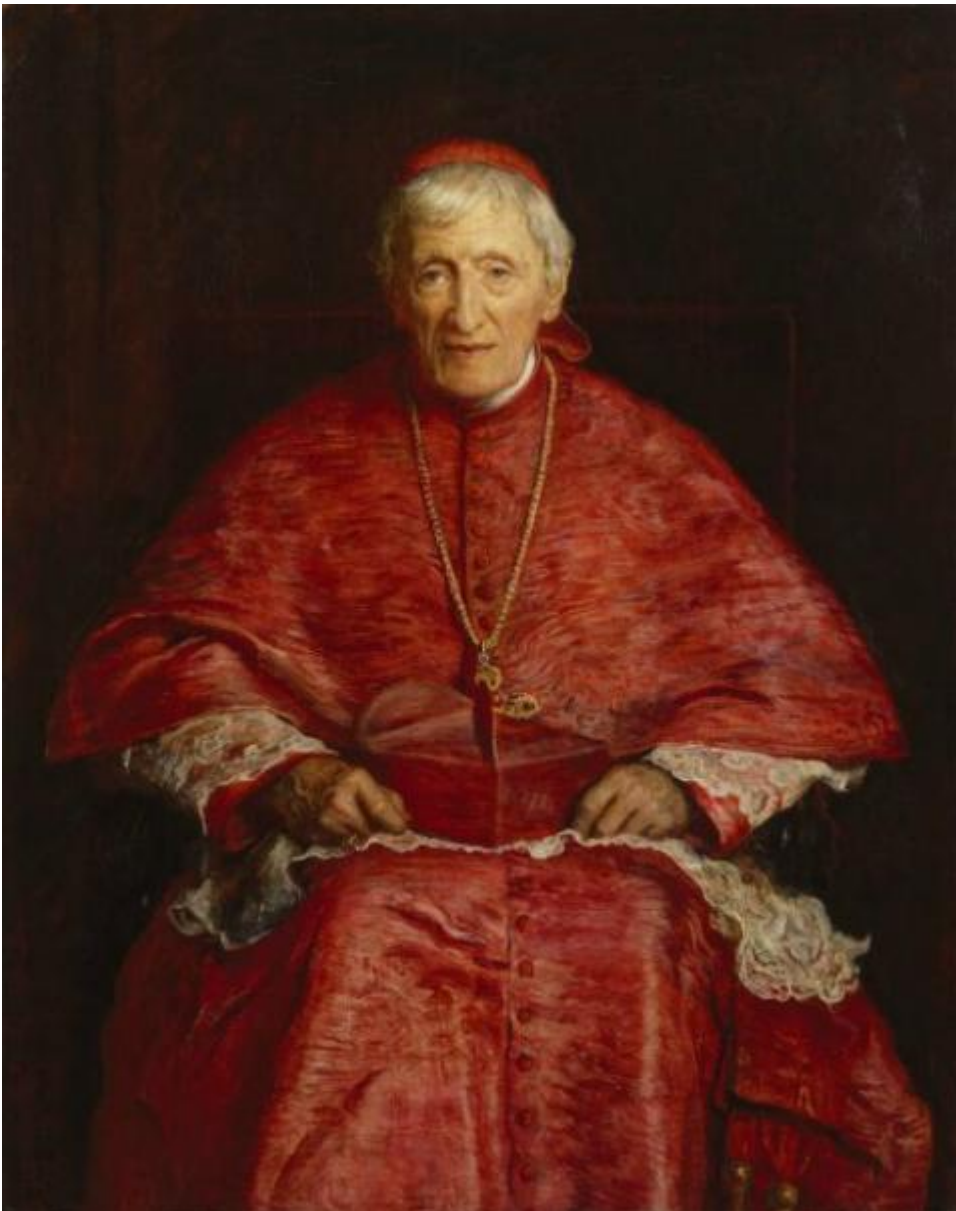
Portrait of John Newman by Sir John Everett Millais, oil on canvas, 1881