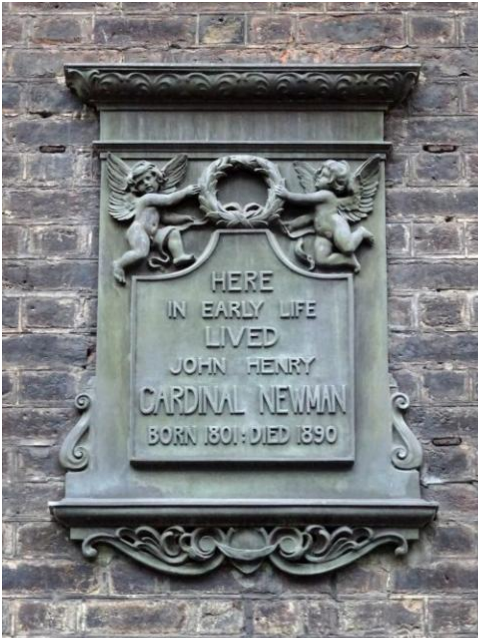
Plaque installed by the Bedford Estate at 17 Southampton Place, Holborn, London

This may be due in part to his vast output in poetry, hymns, reflections and novels, and in classic works such as his Meditations and Devotions, Parochial and Plain Sermons , and autobiographical Apologia Pro Vita Sua , which are still in print.