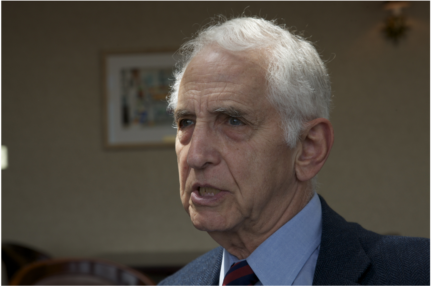
Daniel Ellsberg, in a 2008 photo