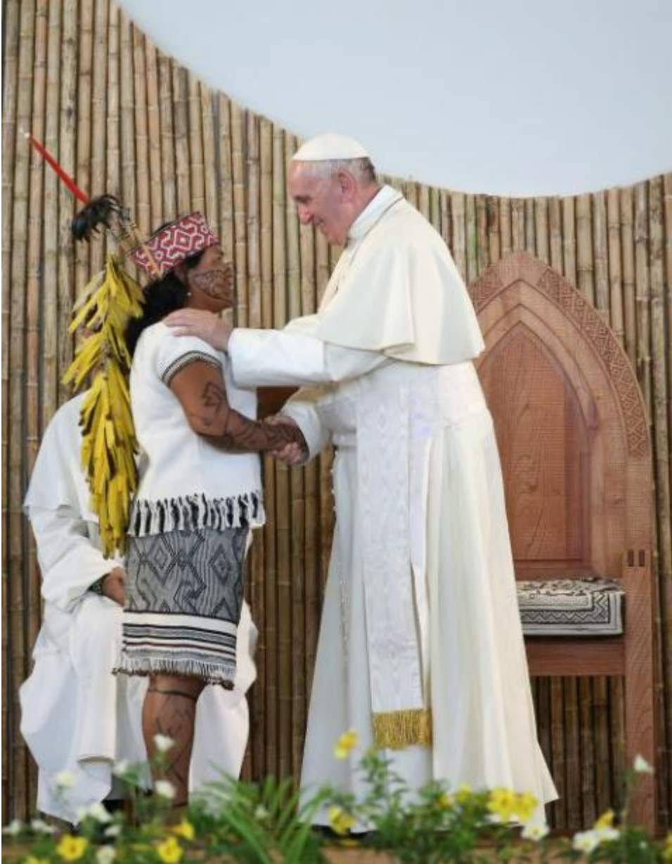
Pope Francis is greeted by a member of an indigenous group from the Amazon region during a meeting at the Coliseo Regional Madre de Dios in Puerto Maldonado, Peru, Jan. 19, 2018.

this synod would draw global attention to a region that has seen indigenous peoples robbed of both their land and their right to self-determination. These peoples have often been victims of drug and human trafficking. Moreover, there are more than 100 indigenous communities in that region that are "voluntarily isolated" from the larger world; their fragile existence is now under threat. Francis is committed to a polyhedral vision of both church and society, where genuine cultural differences do not threaten but rather enrich an authentic global consciousness.