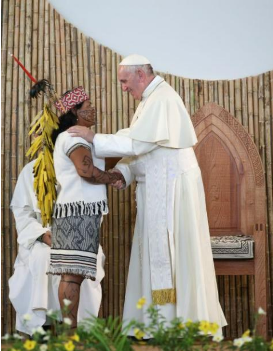
Pope Francis is greeted by a member of an indigenous group from the Amazon region during a meeting at the Coliseo Regional Madre de Dios in Puerto Maldonado, Peru, Jan. 19, 2018.

this synod would draw global attention to a region that has seen indigenous peoples robbed of both their land and their right to self-determination. These peoples have often been victims of drug and human trafficking. Moreover, there are more than 100 indigenous communities in that region that are "voluntarily isolated" from the larger world; their fragile existence is now under threat. Francis is committed to a polyhedral vision of both church and society, where genuine cultural differences do not threaten but rather enrich an authentic global consciousness.